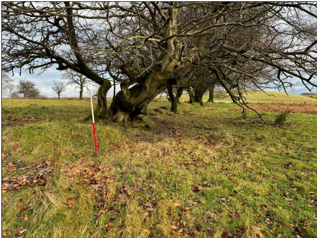
Plate 77. Southeast facing view of historic field boundary to east of Upper Tip (Tip 2).