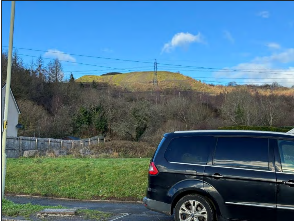
Plate 80. North facing general view of Tips (HA4) from Llanfabon Drive.