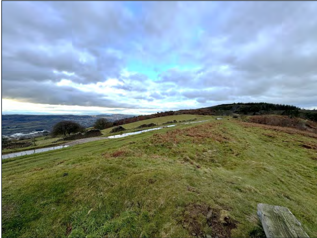
Plate 18. Southwest facing view from Twyn yr Oerfel Eastern Round Barrow (HA8) showing tips in background.