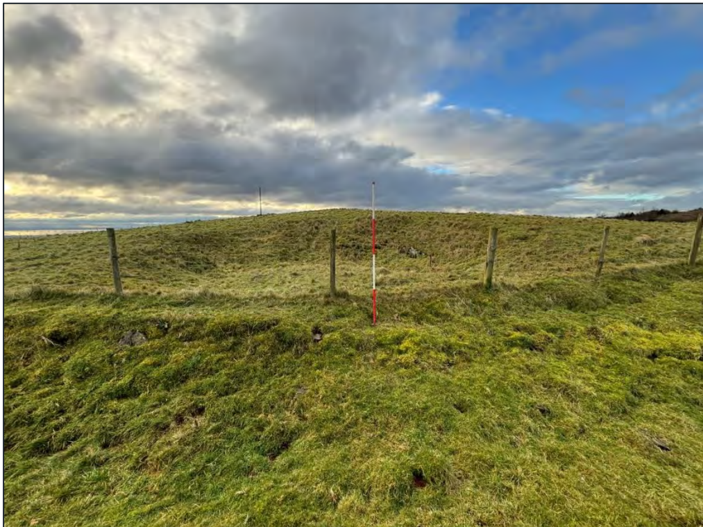
Plate 19. Southwest facing view of Quarry (HA49)