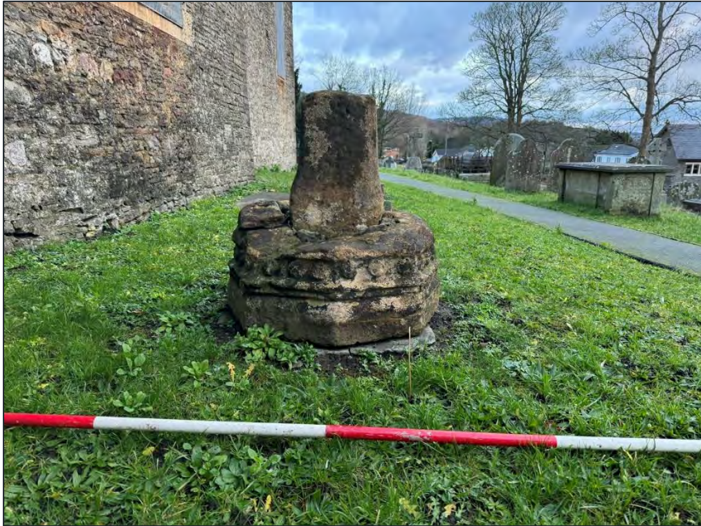
Plate 88. East facing view of St Barrwg's Churchyard Cross (HA34).