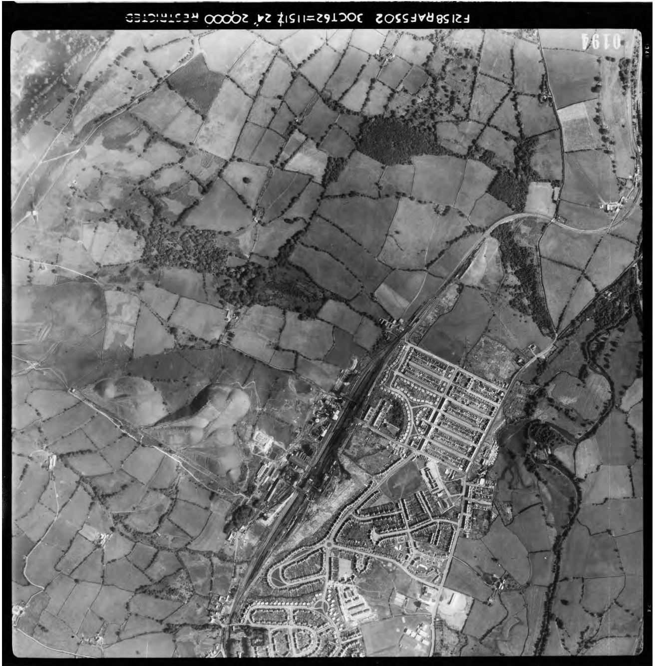
Plate 3. 1962 aerial photograph