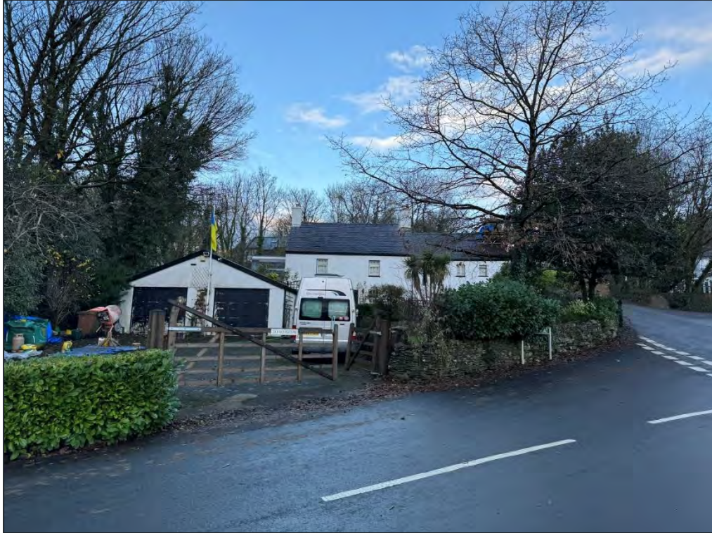
Plate 90. North facing view of Old Rectory (LB13551)