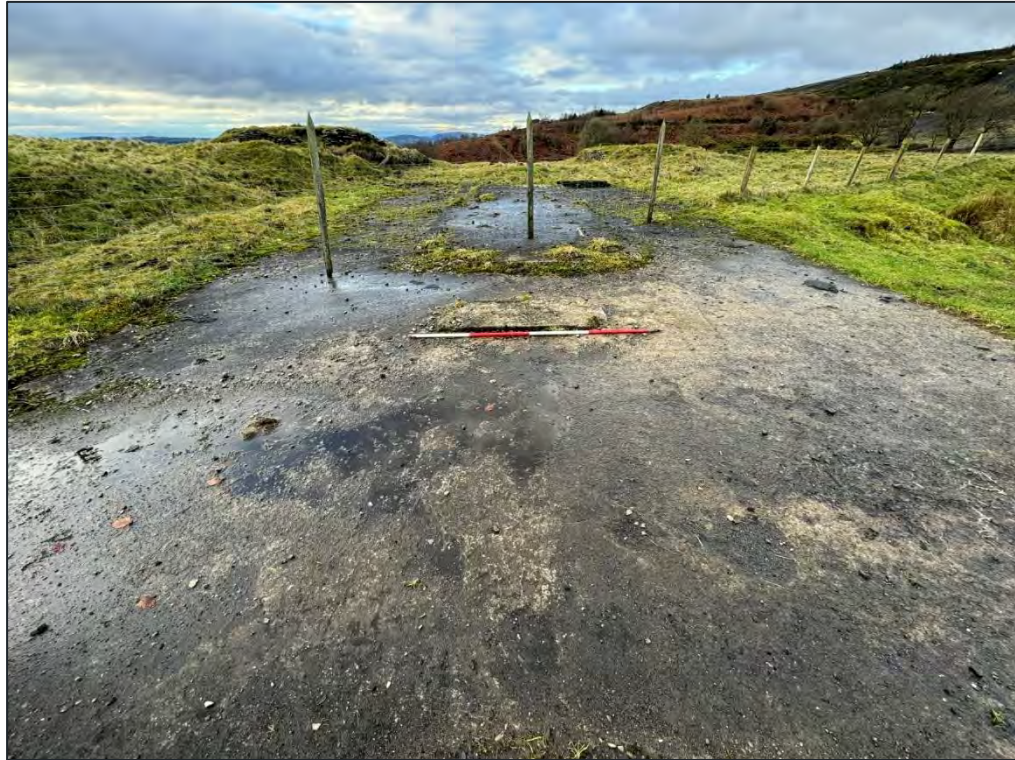
Plate 22. South facing view of possible aerial ropeway winding house (HA50)