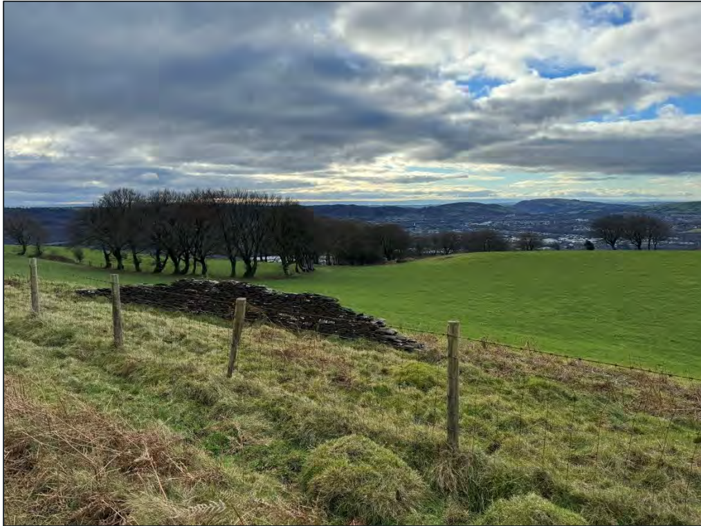
Plate 64. South facing view from southwest of Upper Tip (Tip 2).