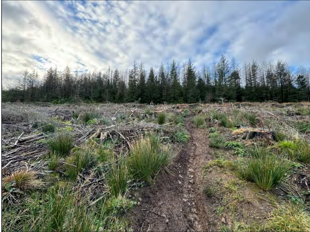
Plate 12. Southwest facing view of Upper Tip (Tip 2) from Mynydd y Grug field (HA1) showing trail bike tracks