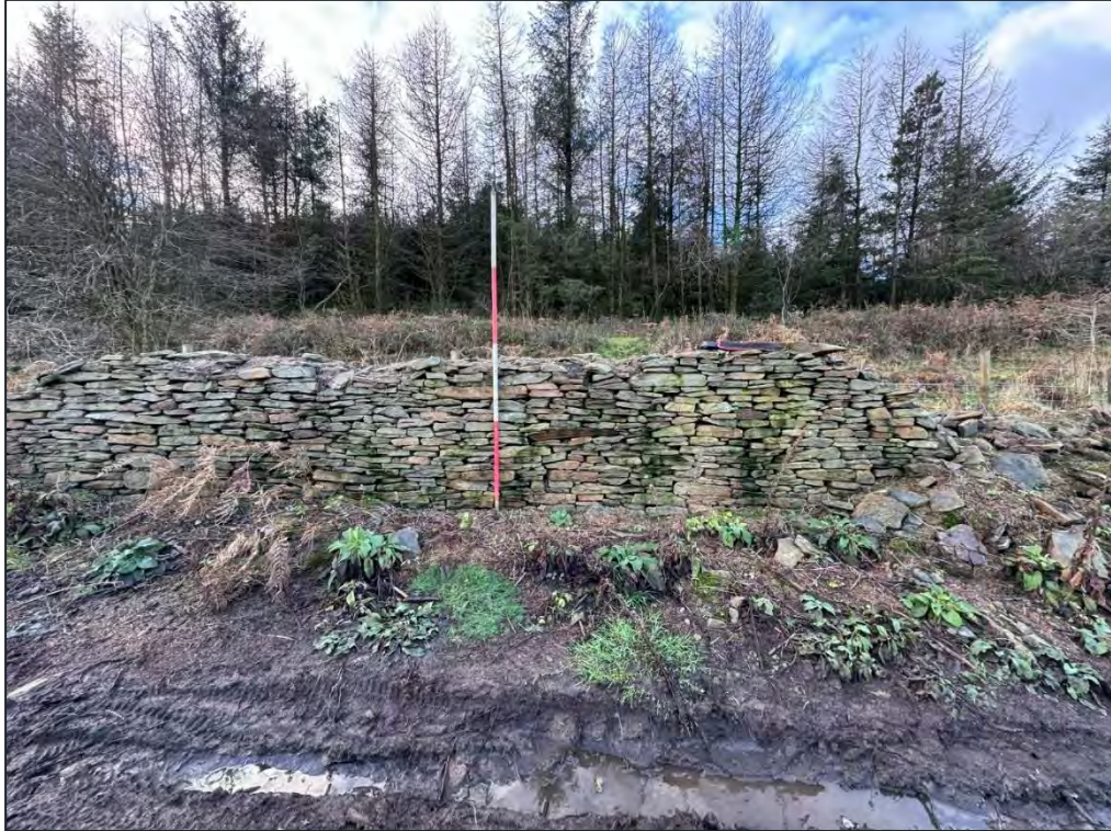
Plate 10. Southwest facing view of Mynydd y Grug field boundary (HA1)