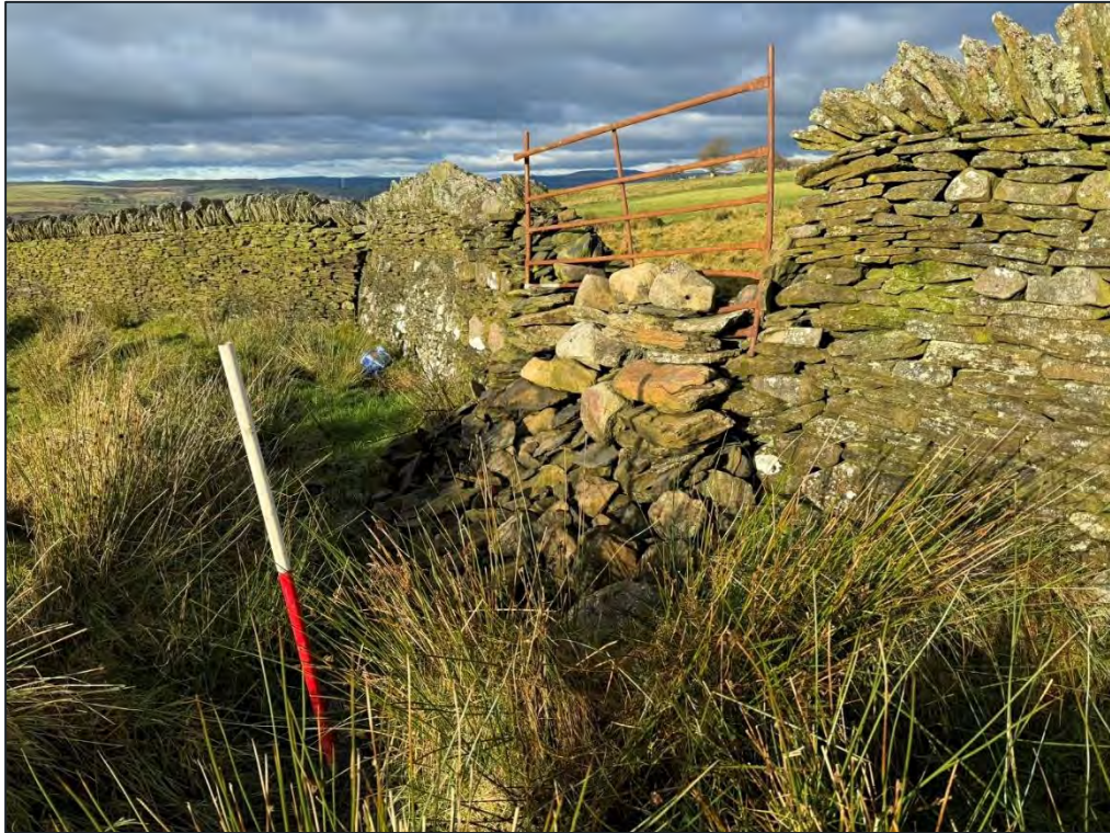
Plate 44. West facing detailed view of drystone wall repair at northwest limit of Common (HA5)