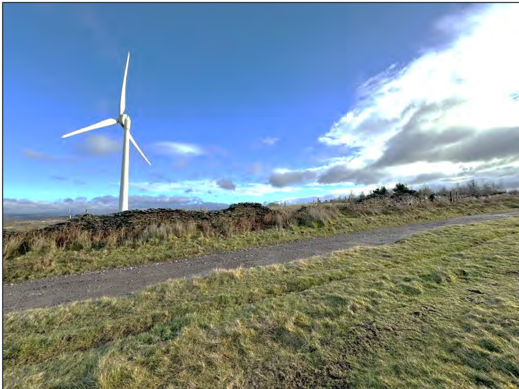
Plate 41. East facing view of drystone wall boundary defining northeast limit of Common (HA5)