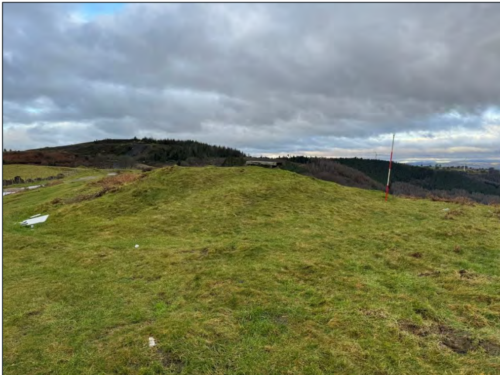
Plate 15. West facing view of Twyn yr Oerfel Eastern Round Barrow (HA8)