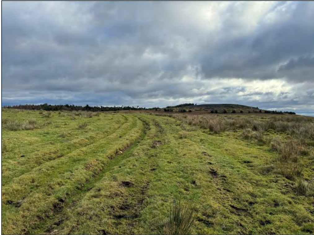
Plate 54. Southeast facing view of Common (HA5) towards Upper Tip (Tip 2).