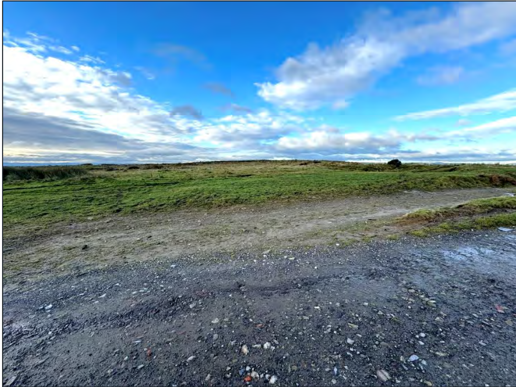
Plate 32. Southwest facing view from Twyn Cae-Hugh Round Barrow (HA6).