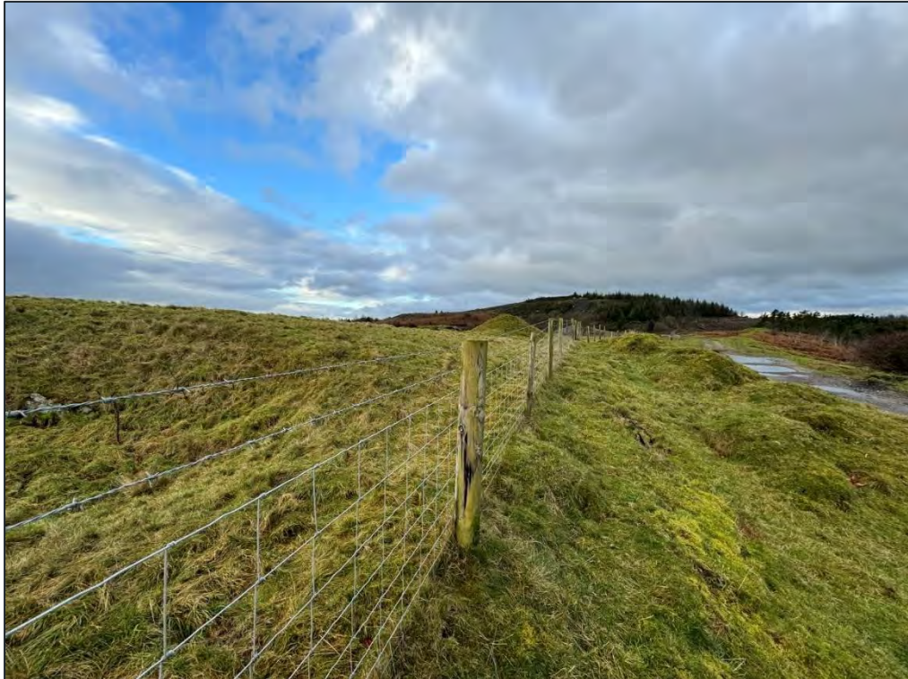
Plate 20. West facing view from Quarry (HA49) towards Upper Tip (Tip 2)