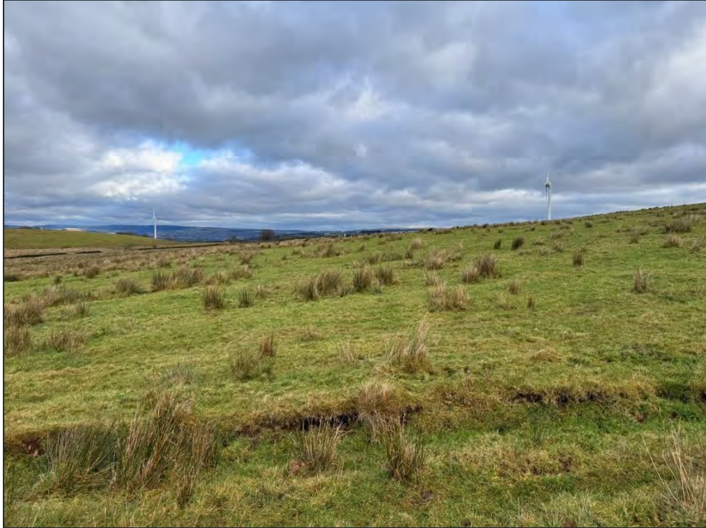
Plate 52. North facing view of Common (HA5).