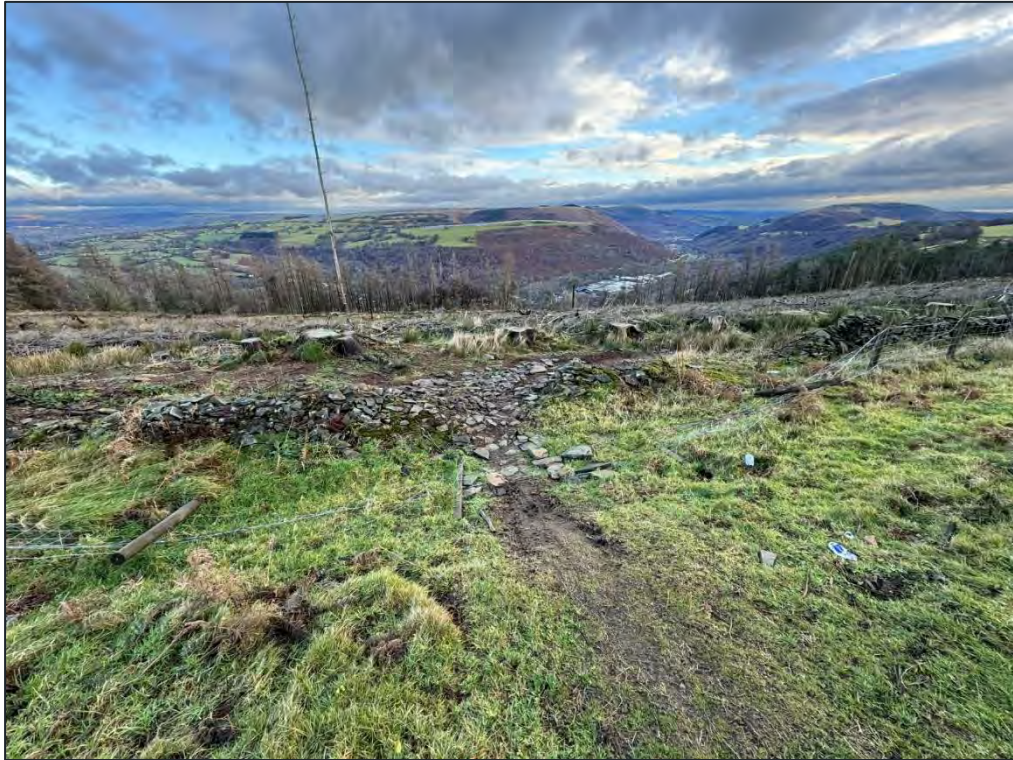
Plate 14. Northeast facing view of Mynydd y Grug field boundary (HA1)