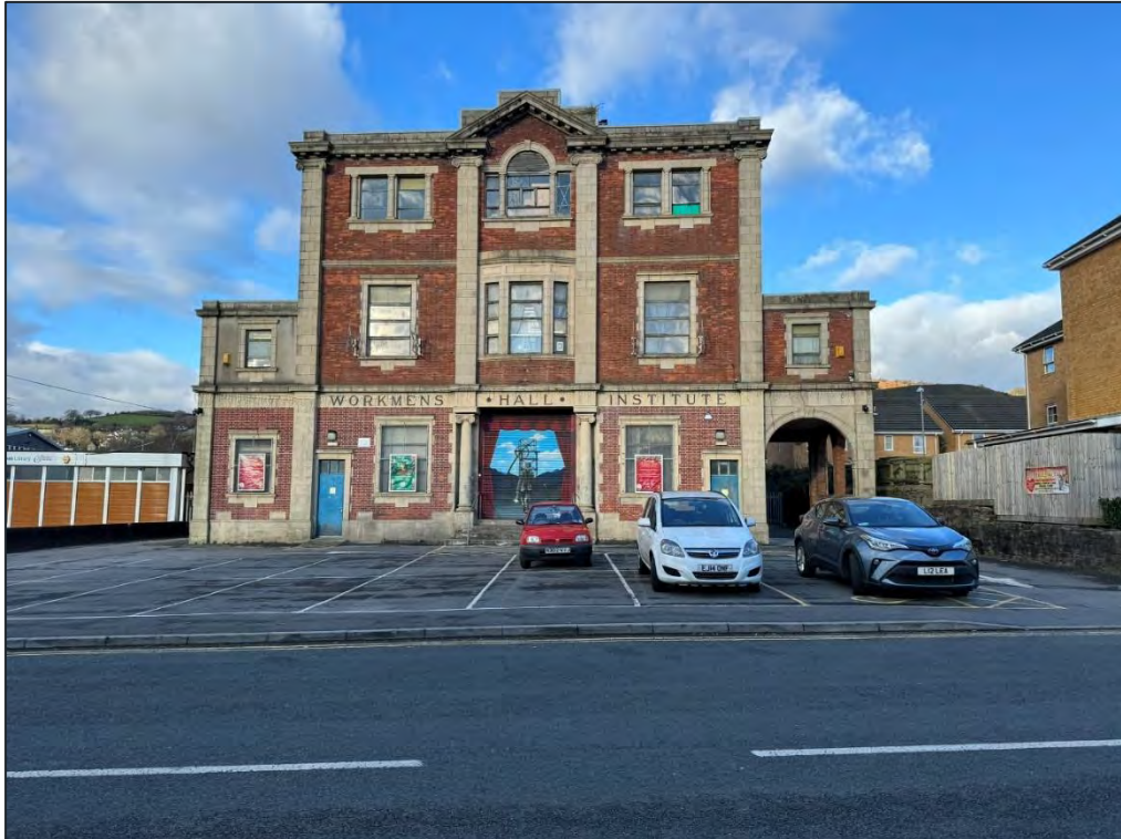
Plate 82. North facing view of Workmen's Hall Institute (LB21307).