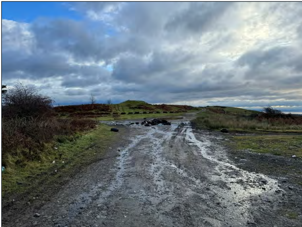
Plate 27. East facing view towards Twyn yr Oerfel Western Round Barrow (HA7) from eastern boundary of Proposed Scheme.