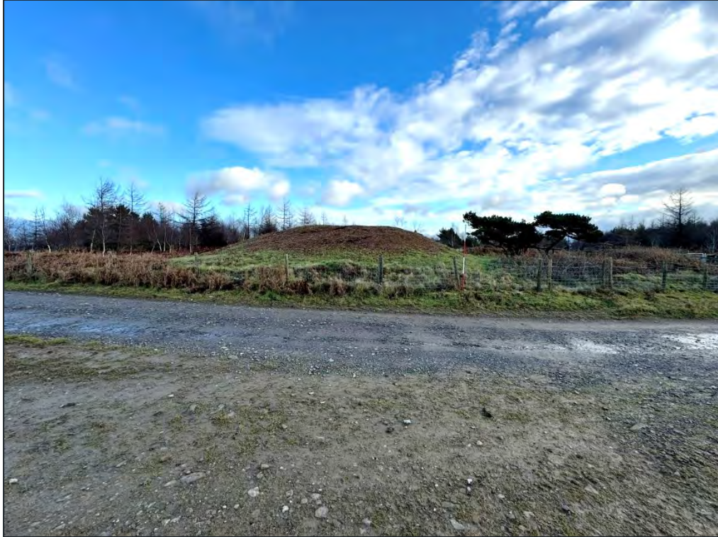
Plate 30. Northeast facing view of Twyn Cae-Hugh Round Barrow (HA6).