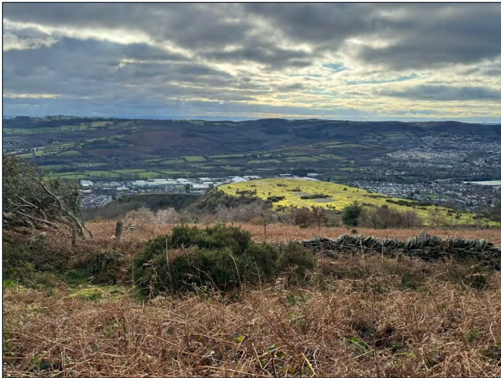
Plate 75. South facing view of Lower Tip (Tip 1) from southeast of Upper Tip (Tip 2).