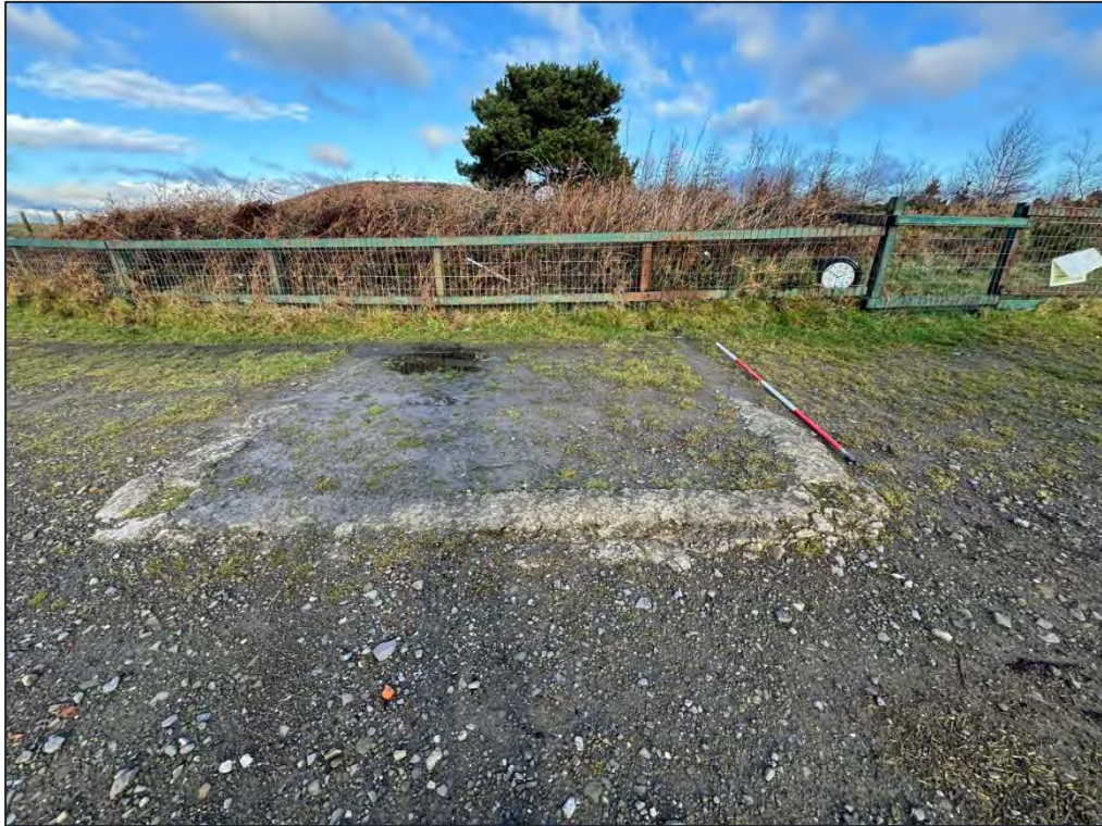
Plate 36. Northwest facing view of concrete footing (HA48).