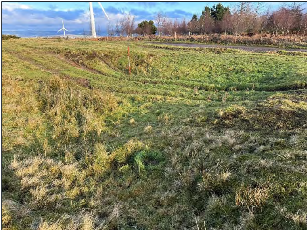
Plate 37. North facing view of pit (HA51)