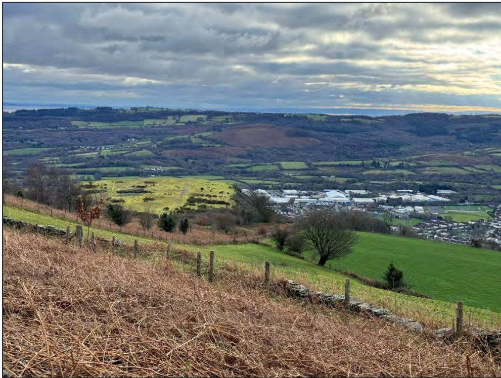
Plate 73. Southeast facing view of Lower Tip (Tip 1) from south of Upper Tip (Tip 2).