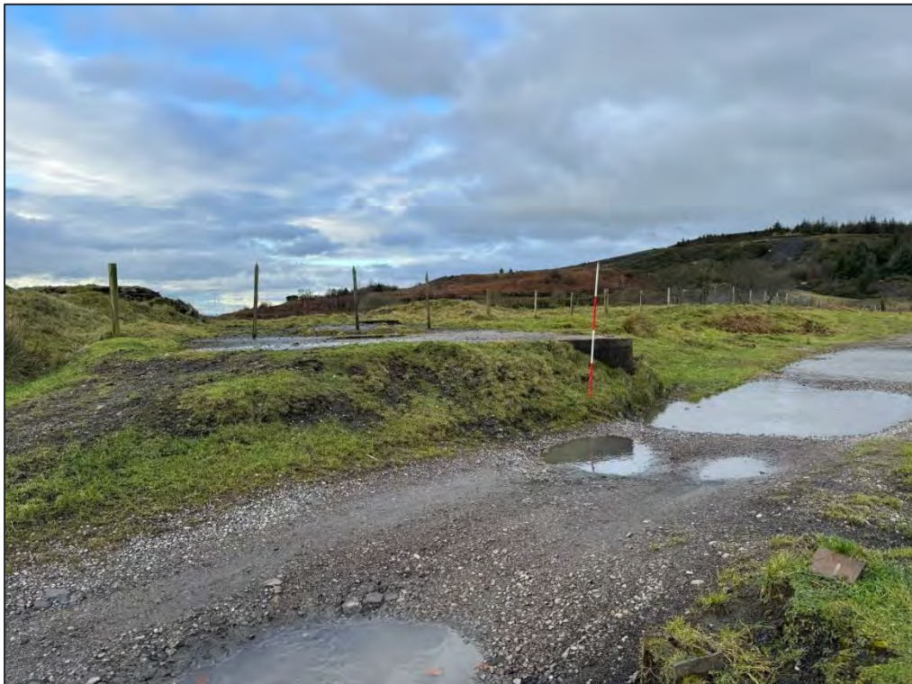
Plate 21. Southwest facing view of possible aerial ropeway winding house (HA50)