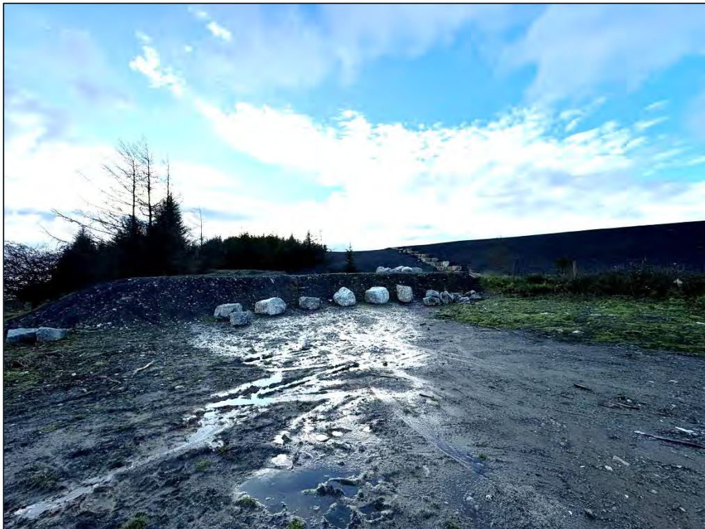
Plate 29. Southwest facing view of Upper Tip (Tip 2)