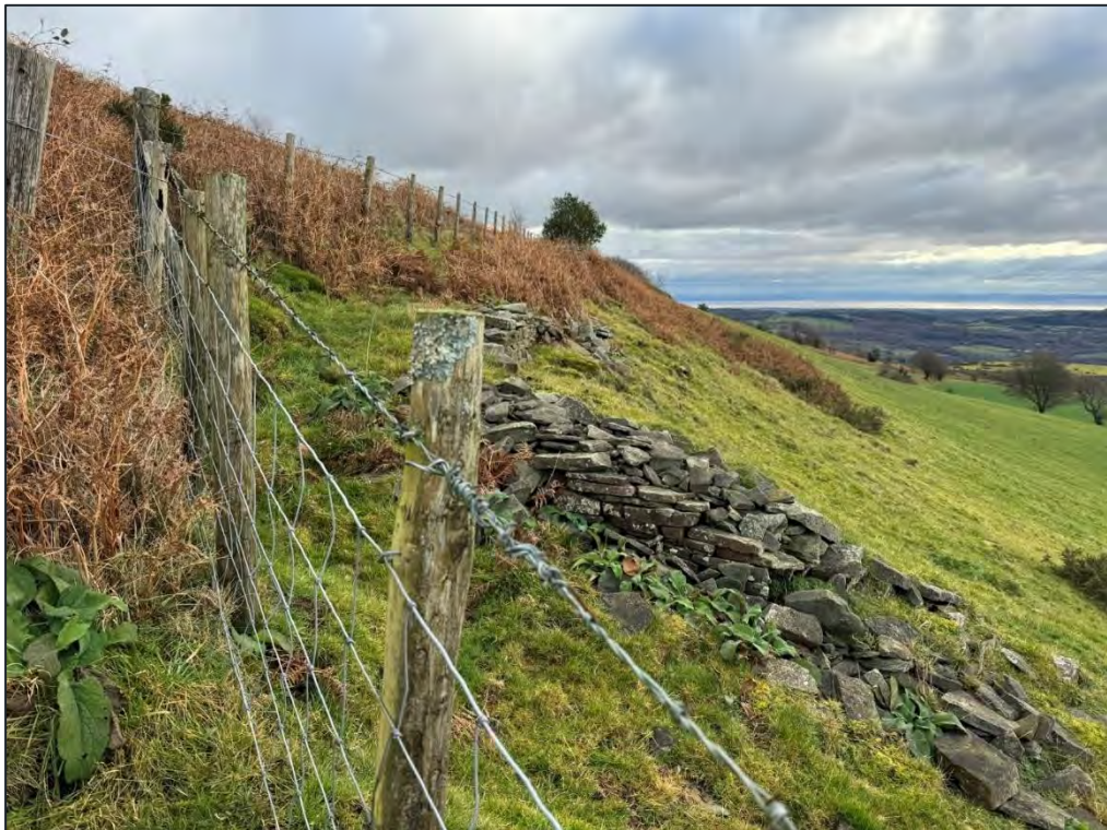
Plate 69. Southeast facing view from Barn (HA19) showing drystone boundary wall south of Upper Tip (Tip 2).