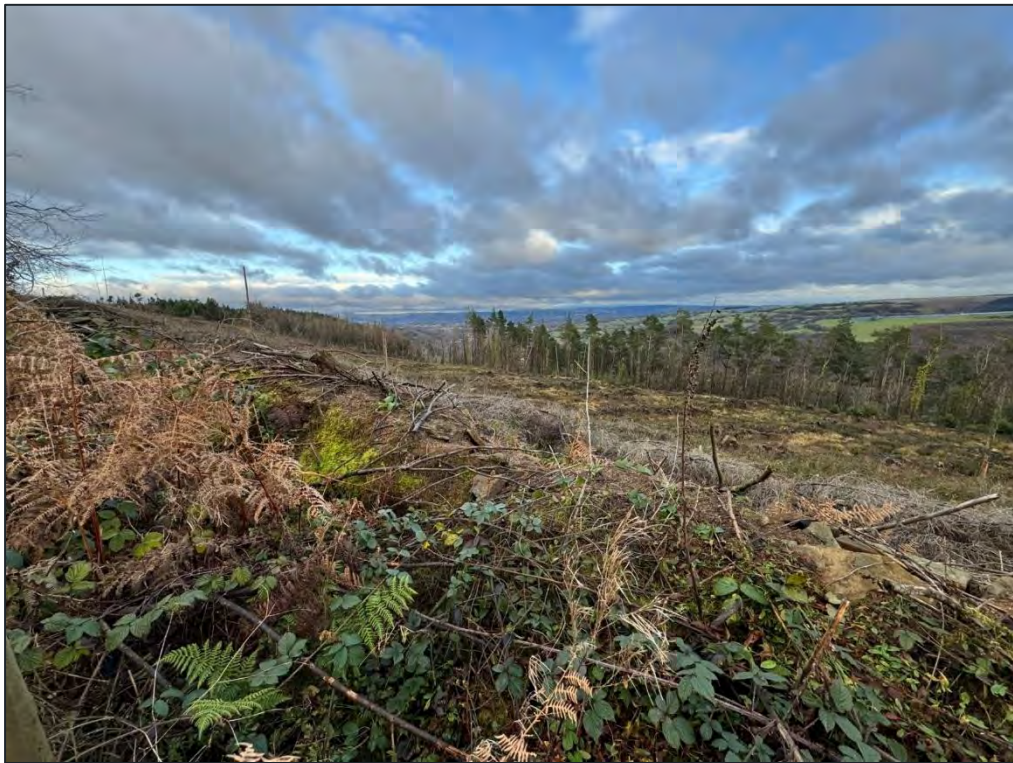
Plate 11. North facing view from Mynydd y Grug field boundary (HA1)