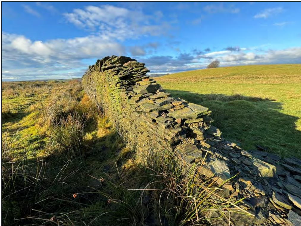
Plate 43. West facing detailed view of drystone wall boundary defining northwest limit of Common (HA5)