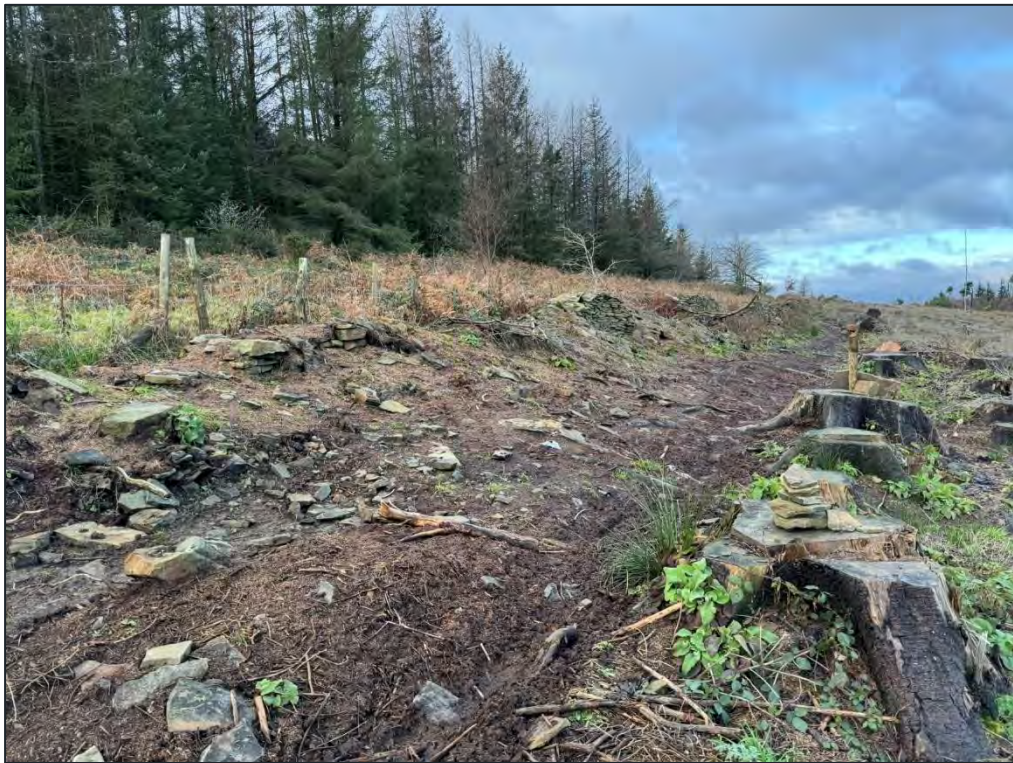
Plate 9. West facing view of Mynydd y Grug field boundary (HA1)