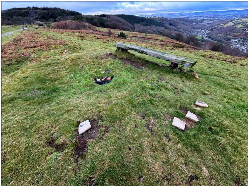
Plate 17. Northwest facing view of Twyn yr Oerfel Eastern Round Barrow (HA8)