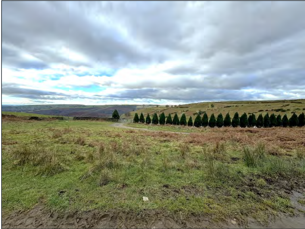
Plate 60. West facing view from forestry track to west of Upper Tip (Tip 2).