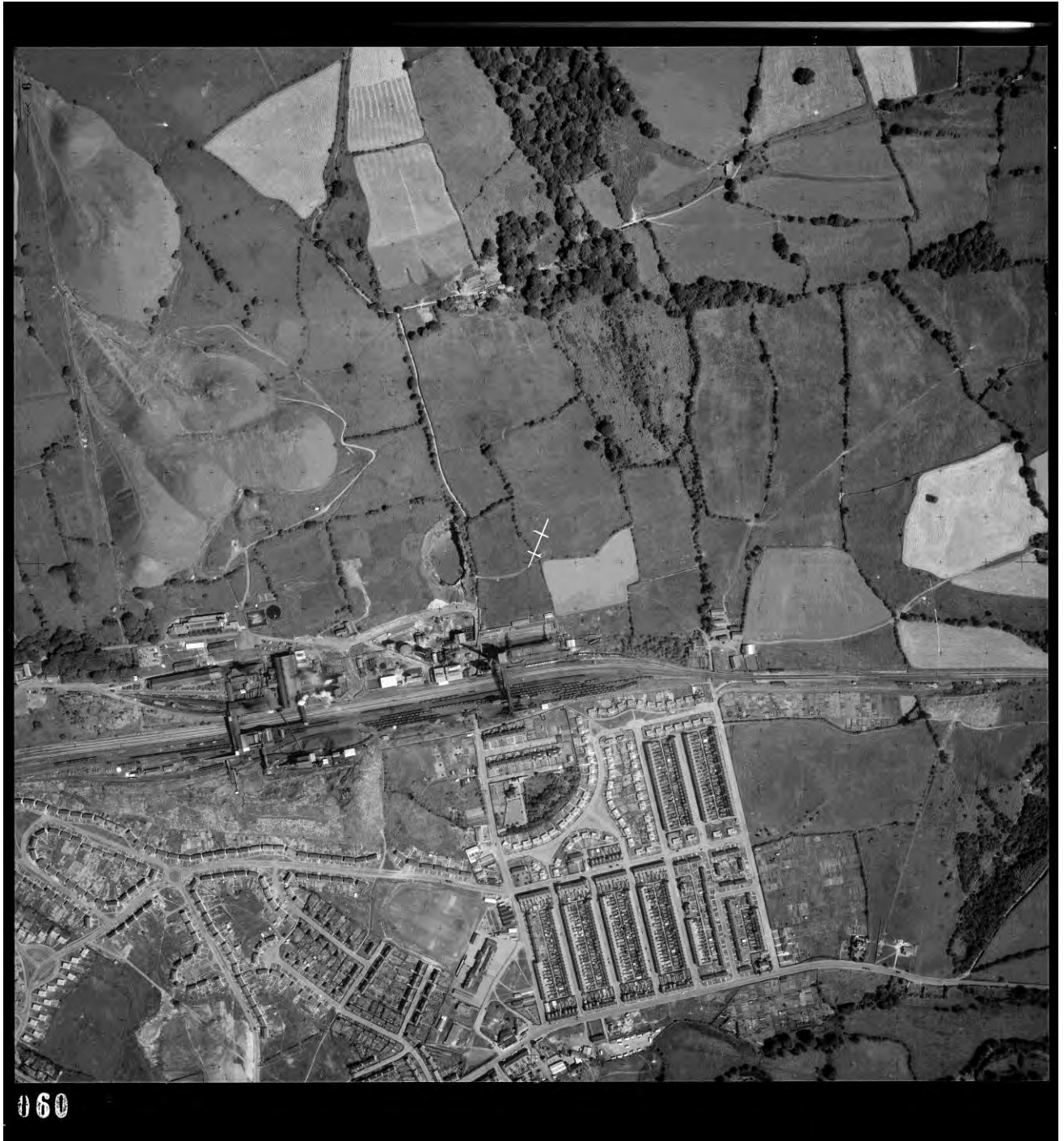
Plate 2. 1958 aerial photograph