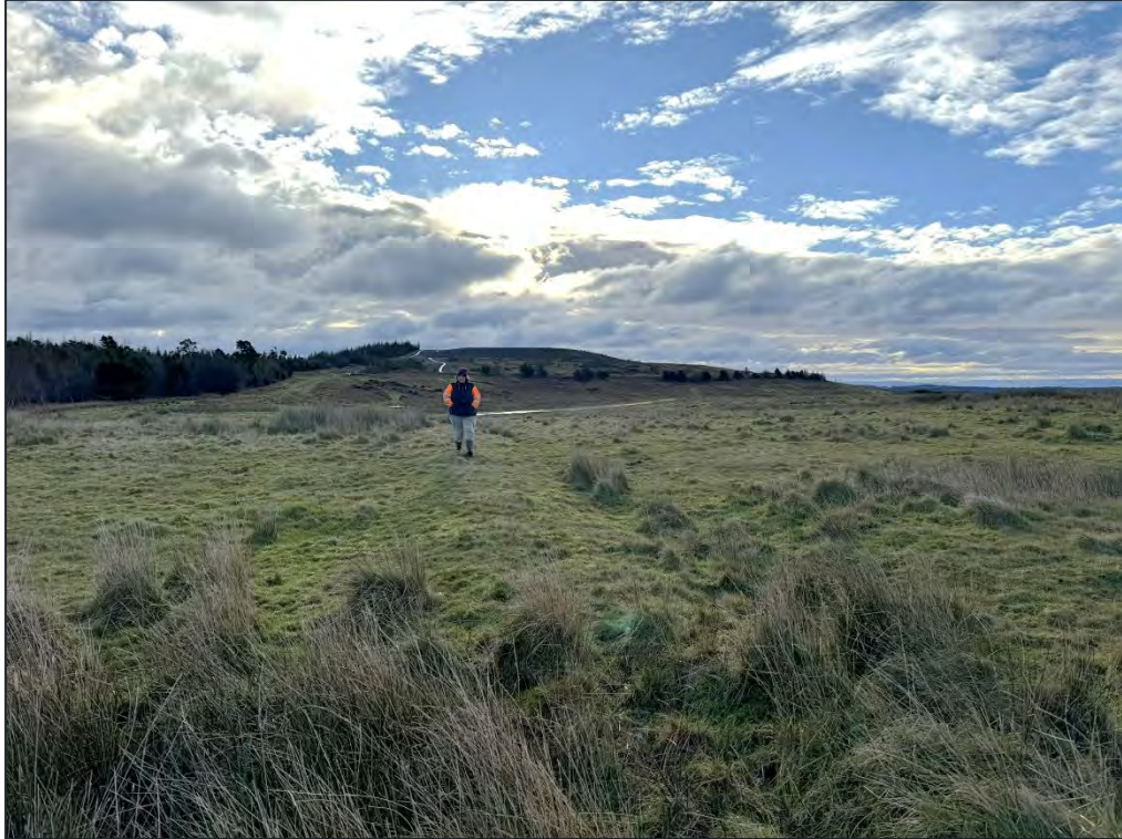
Plate 40. Southeast facing view of ditch and bank enclosure/ pound (HA2)