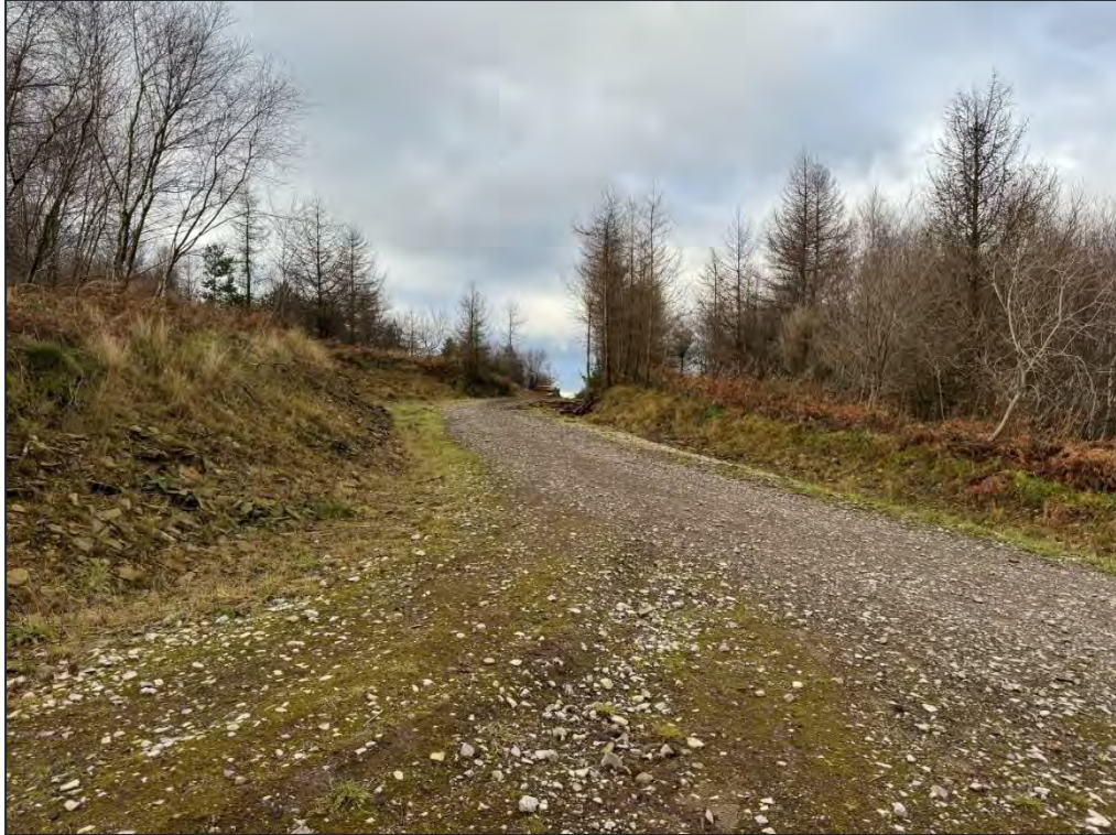
Plate 58. West facing view of forestry track/ haul road.