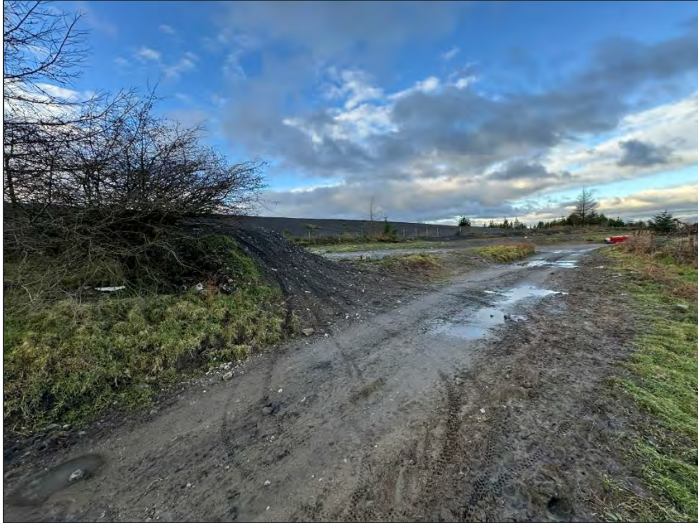
Plate 28. West facing view of Upper Tip (Tip 2) from eastern boundary of Proposed Scheme