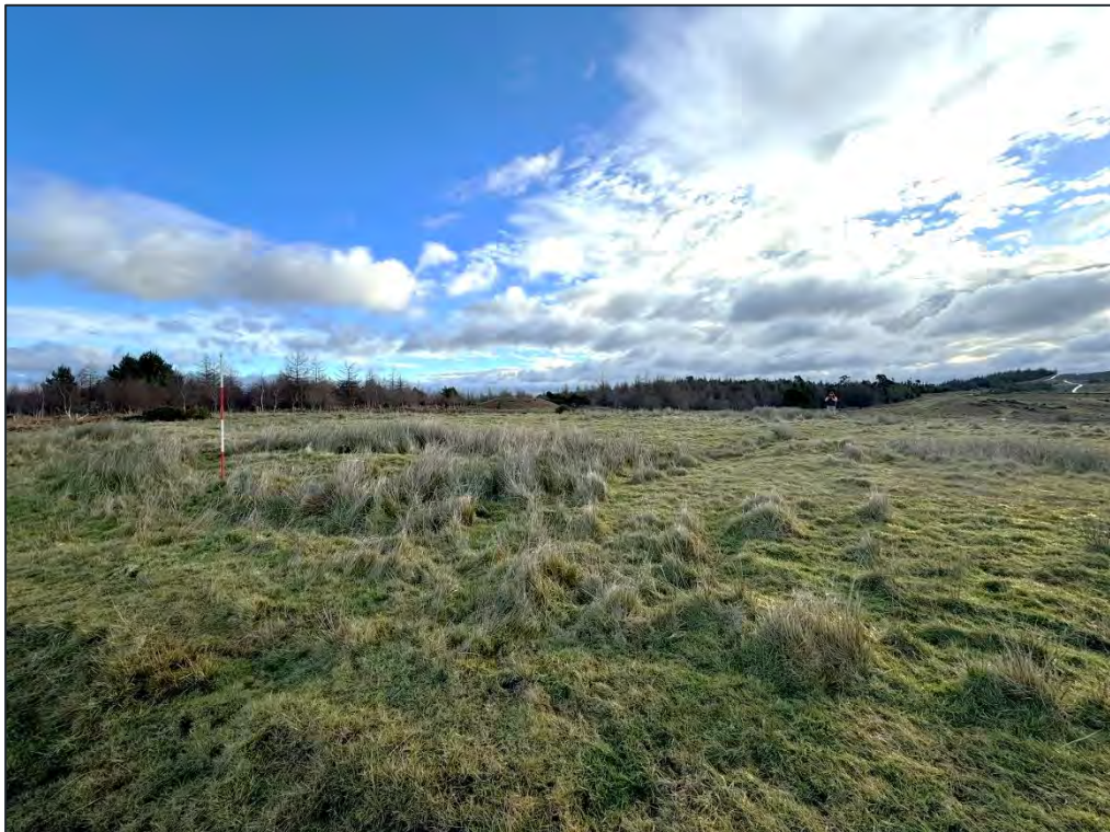
Plate 39. East facing view of ditch and bank enclosure/ pound (HA2)