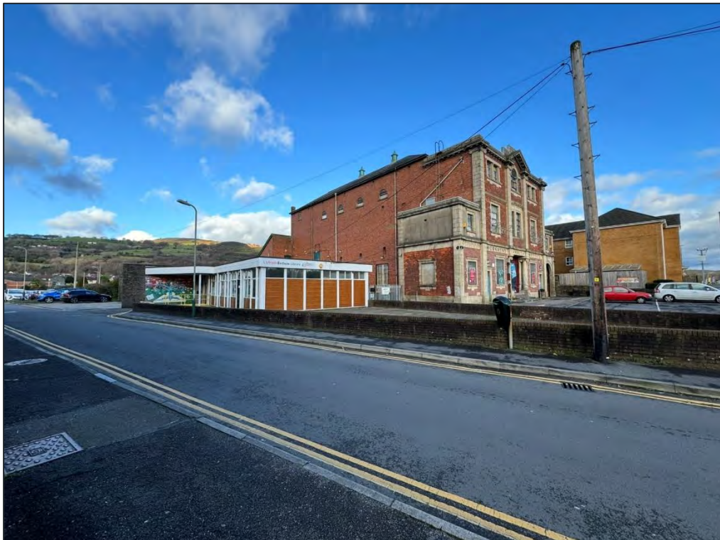
Plate 83. Northeast facing view of Workmen's Hall Institute (LB21307).