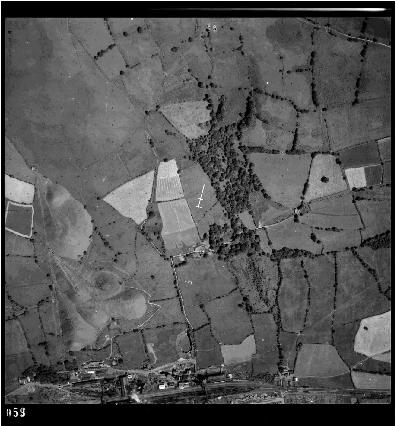
Plate 1. 1958 aerial photograph