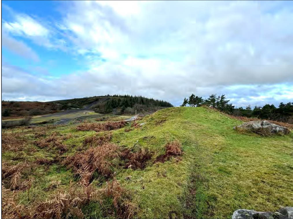
Plate 24. West facing view of Twyn yr Oerfel Western Round Barrow (HA7) showing tips in background.