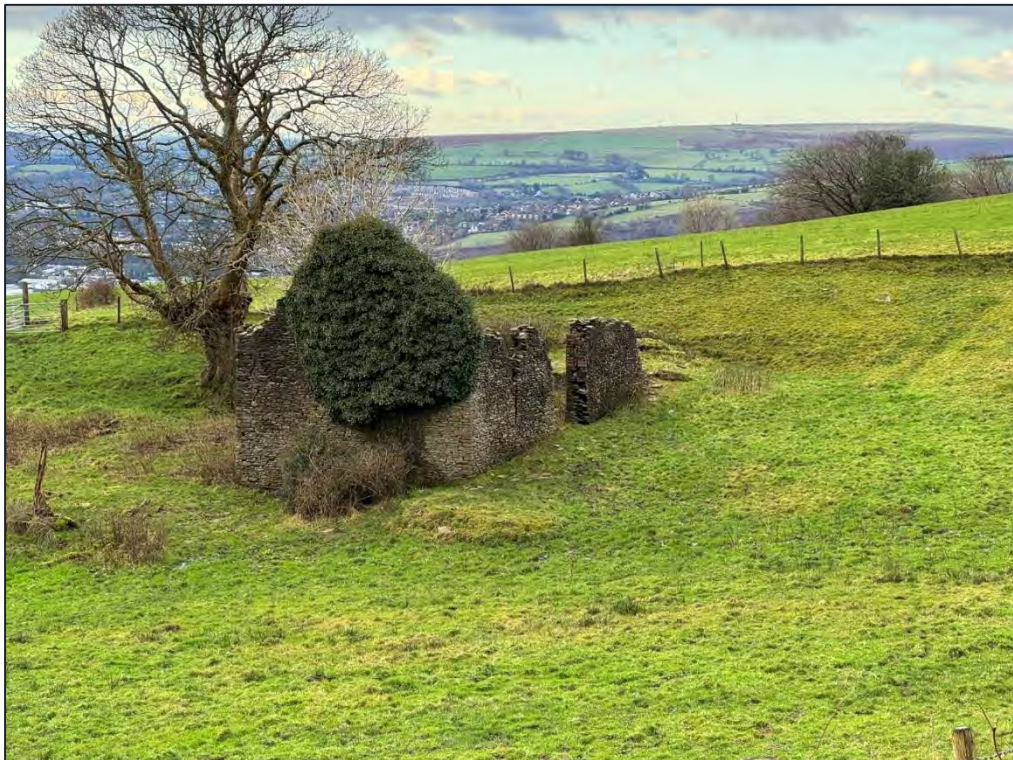
Plate 67. West facing view of Barn (HA19) south of Upper Tip (Tip 2).