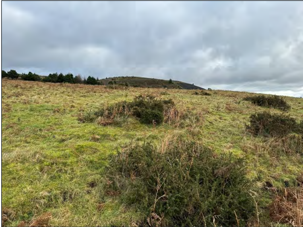
Plate 62. Northeast facing view of Upper Tip (Tip 2) from forestry track.