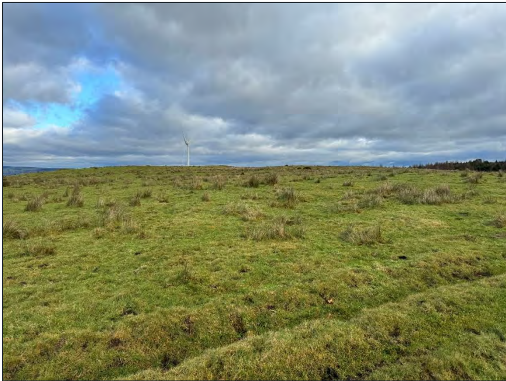
Plate 55. North facing view of Common (HA5) towards Twyn Cae Hugh (HA6).