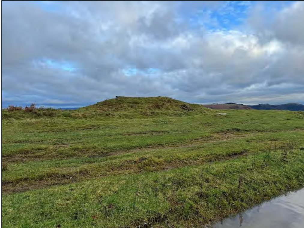
Plate 16. North facing view of Twyn yr Oerfel Eastern Round Barrow (HA8)