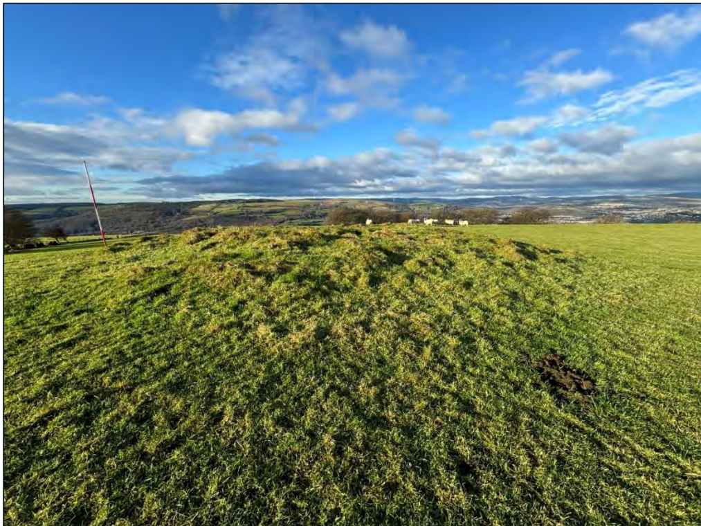
Plate 45. West facing view of Pen-y-rhiw Round Cairn (HA10)