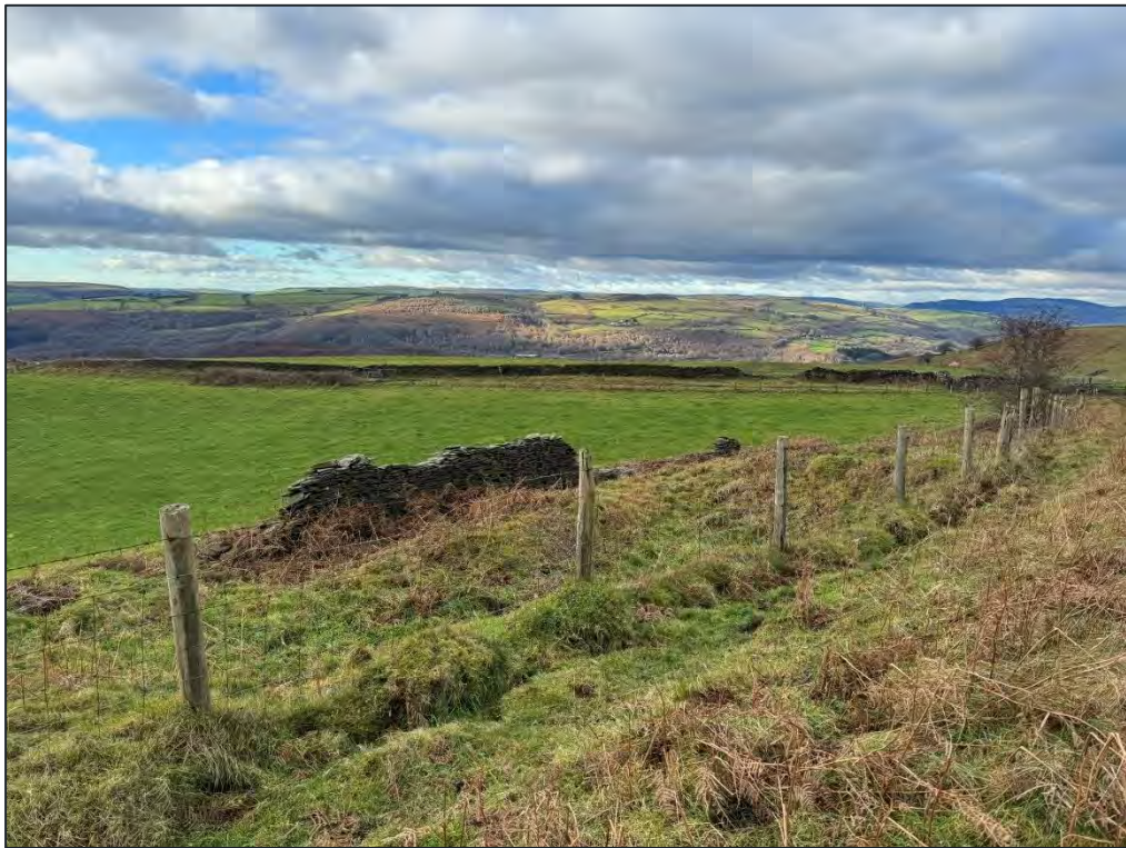
Plate 63. West facing view from southwest of Upper Tip (Tip 2).