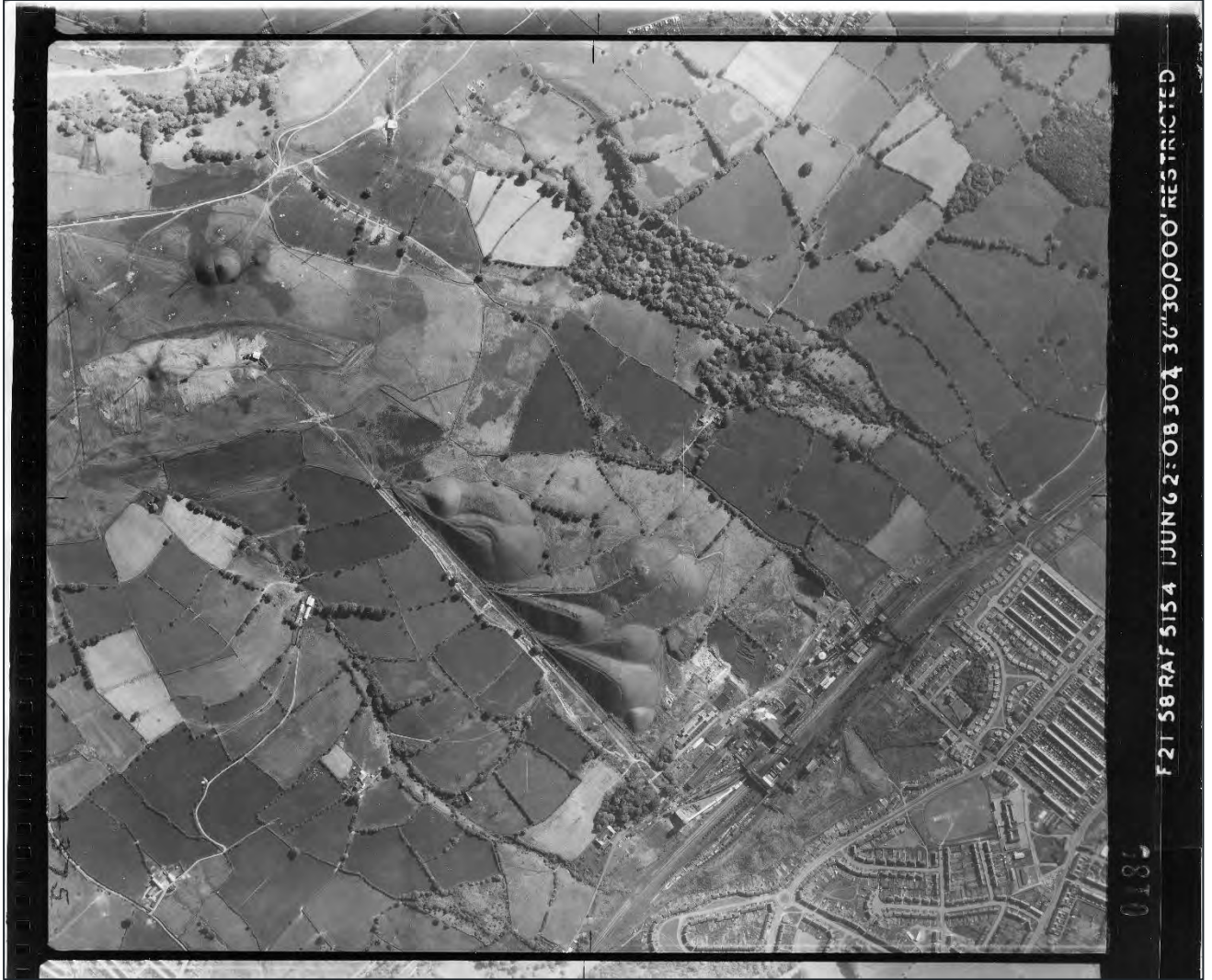
Plate 4. 1962 aerial photograph