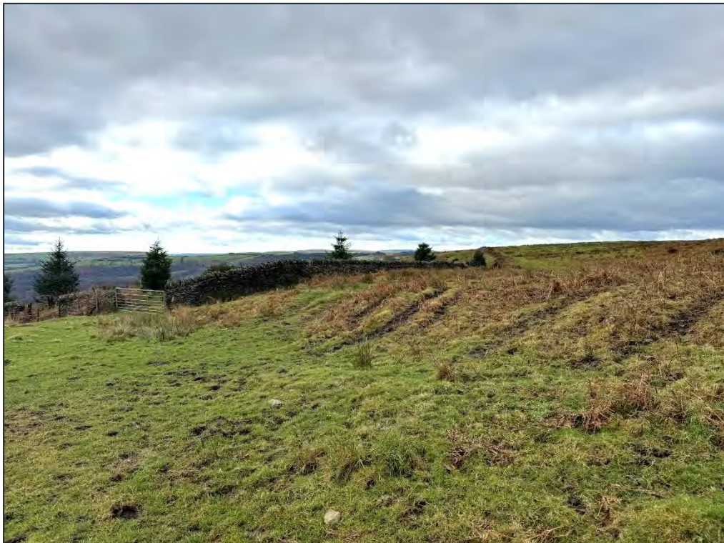
Plate 59. Southwest facing view of southwestern drystone boundary of Common (HA5).