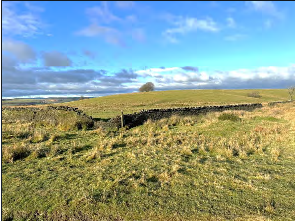
Plate 42. Northwest facing view of drystone wall boundary defining northwest limit of Common (HA5)