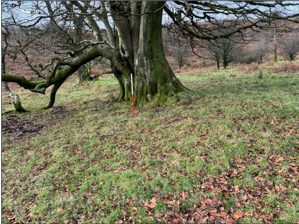
Plate 76. Northwest facing view of historic field boundary to east of Upper Tip (Tip 2).