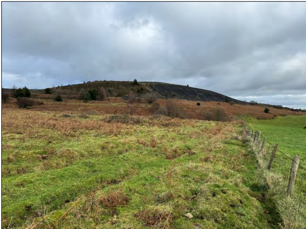
Plate 65. East facing view towards Upper Tip (Tip 2).