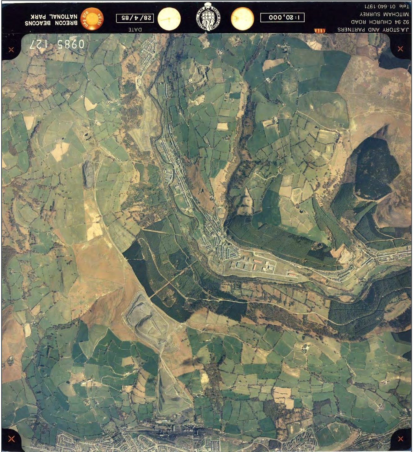
Plate 7. 1985 aerial photograph