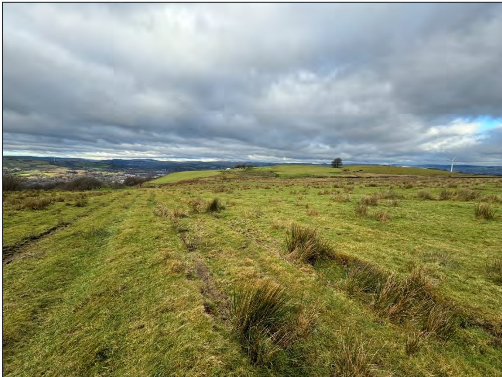
Plate 53. Northwest facing view of Common (HA5).