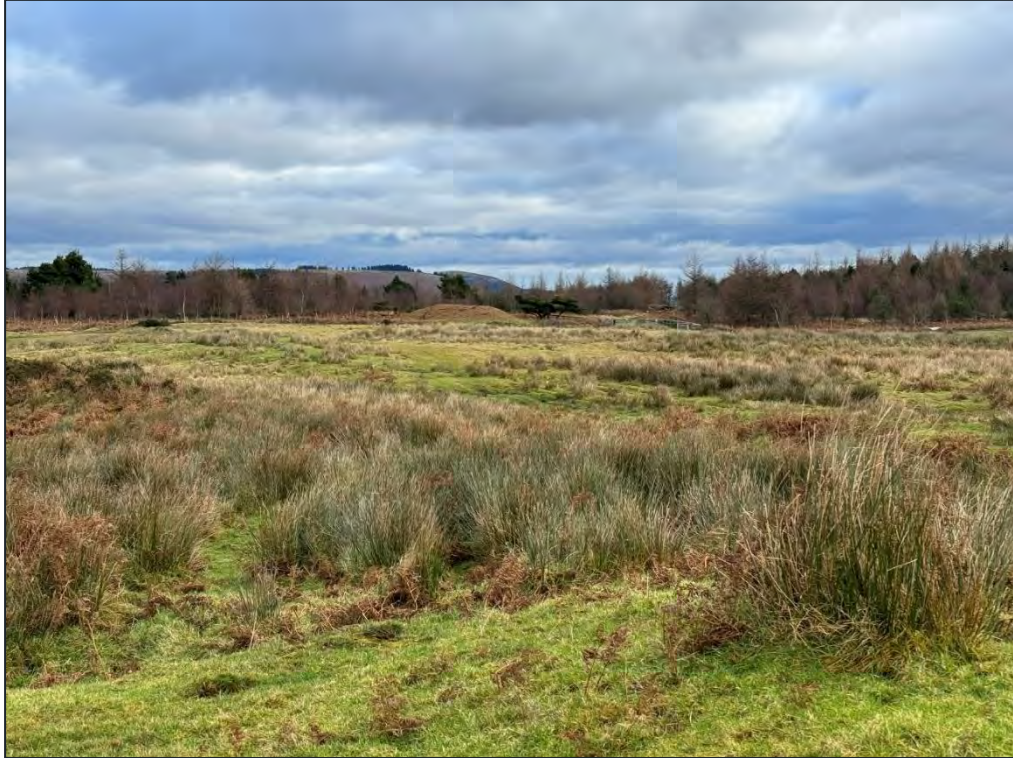
Plate 56. Northeast facing view of Common (HA5) towards Twyn Cae Hugh (HA6).