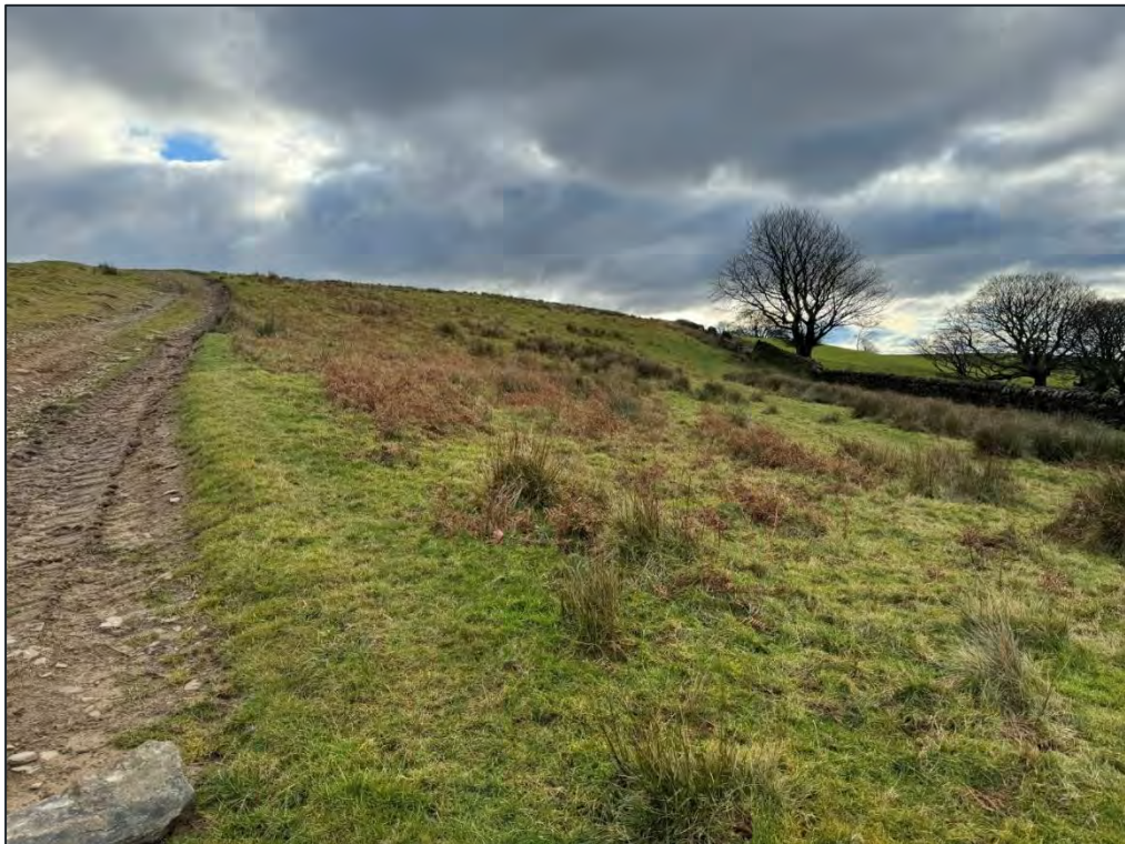
Plate 51. Southeast facing view of Common (HA5).