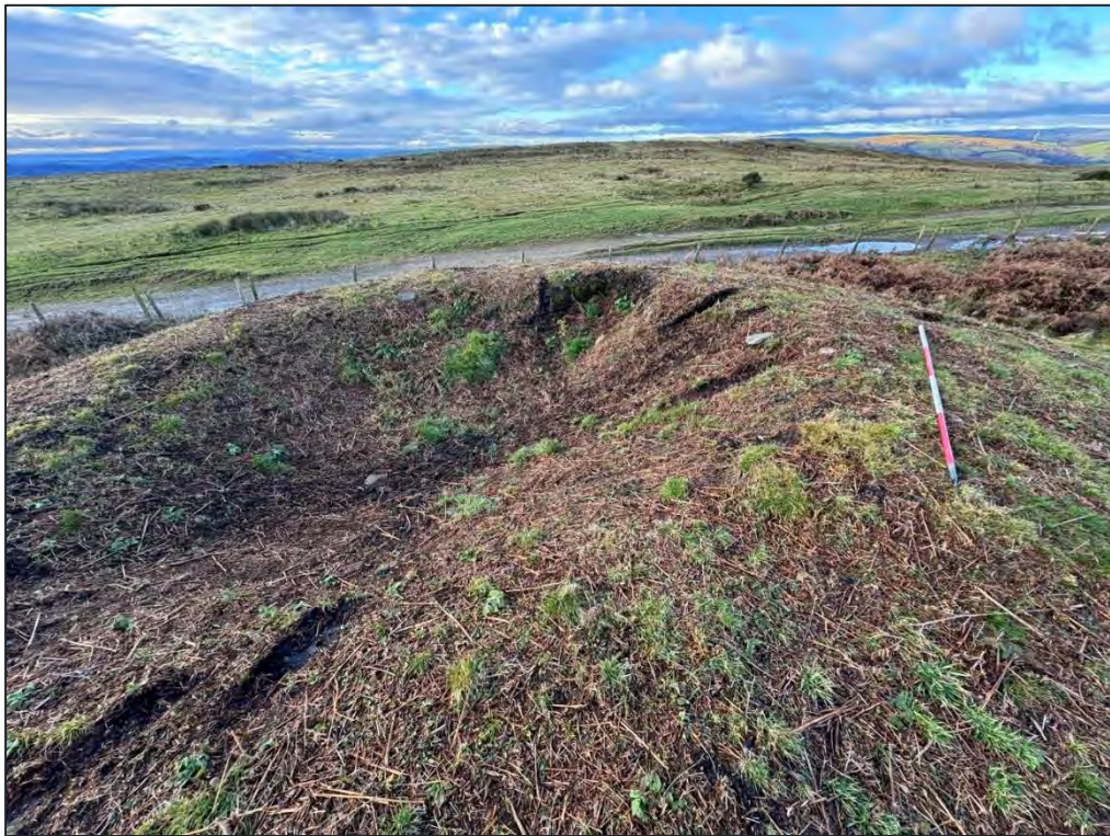
Plate 35. Southwest facing detailed view of Twyn Cae-Hugh Round Barrow (HA6).