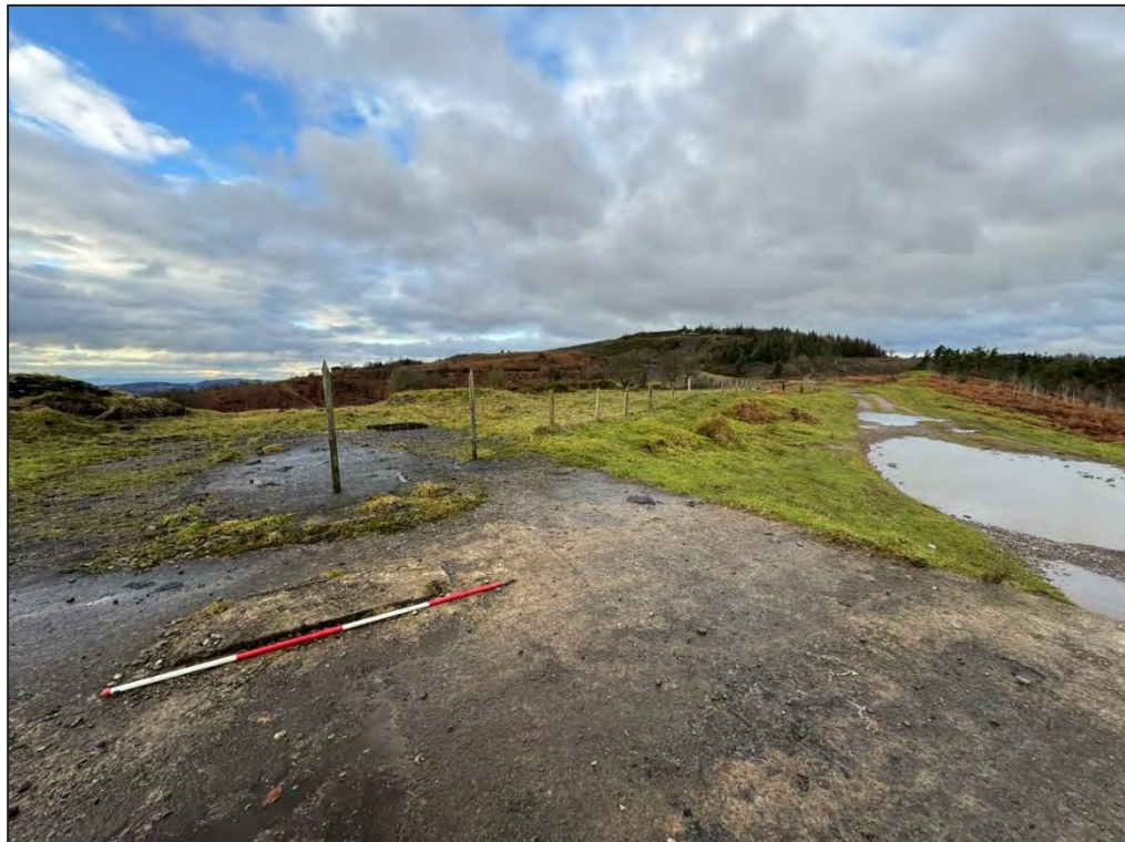
Plate 23. West facing view from possible aerial ropeway winding house (HA50) towards tips