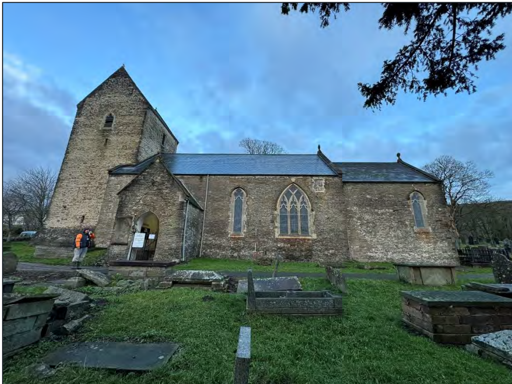
Plate 85. North facing view of St Barrwg's Church, Bedwas (HA35)