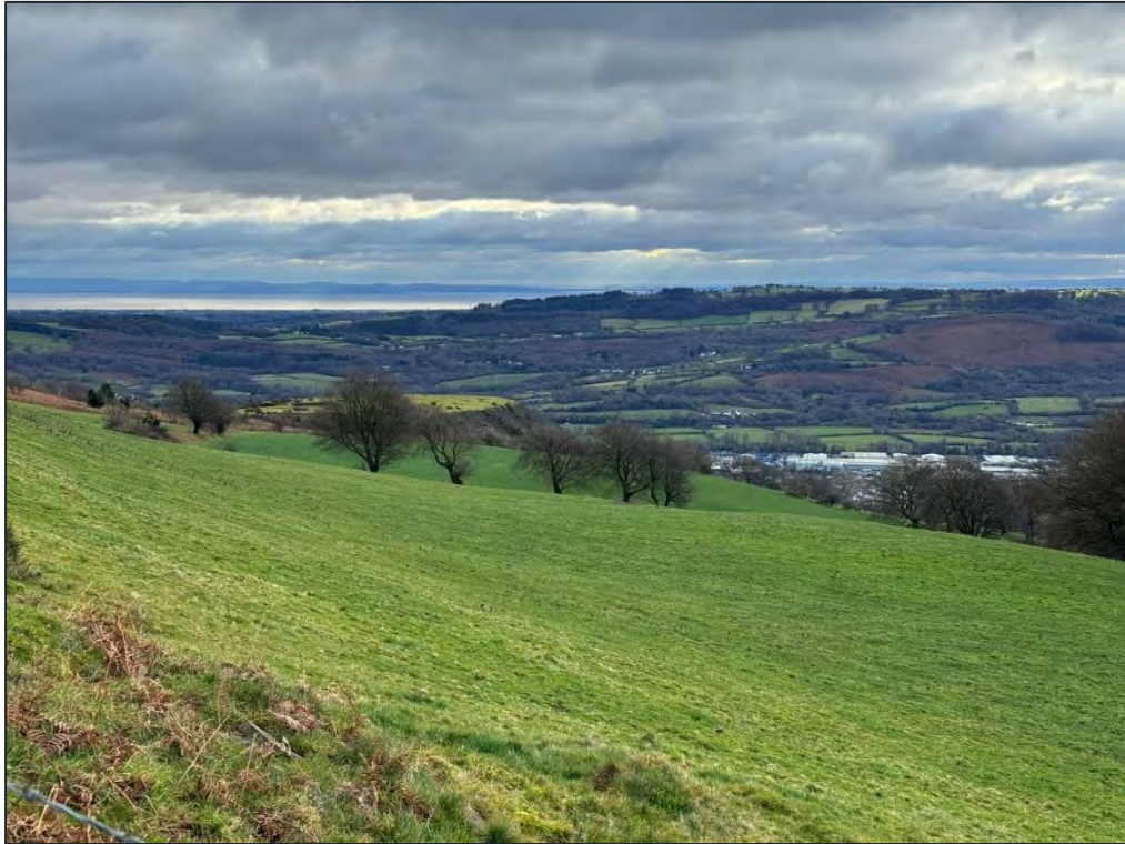
Plate 68. South facing view from Barn (HA19) south of Upper Tip (Tip 2).