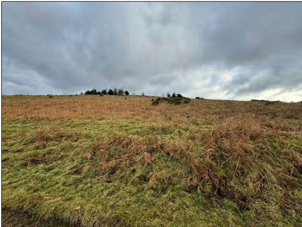
Plate 61. East facing view from forestry track towards Upper Tip (Tip 2).