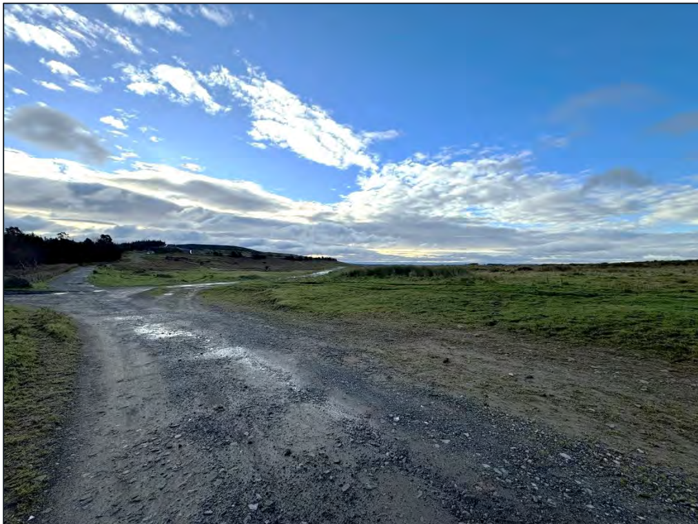
Plate 33. Southeast facing view from Twyn Cae-Hugh Round Barrow (HA6).