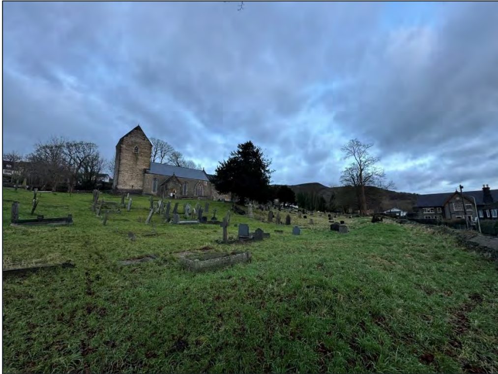
Plate 86. Northeast facing view of St Barrwg's Church, Bedwas (HA35)