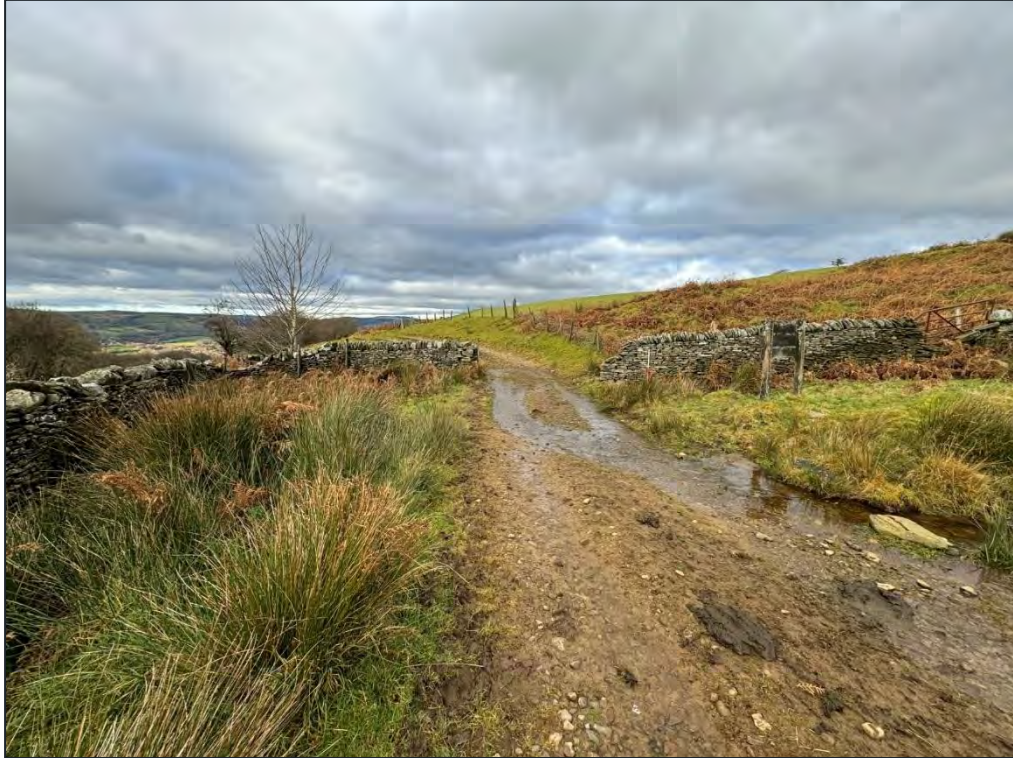
Plate 48. Northwest facing view of northwest corner drystone boundary of Common (HA5).