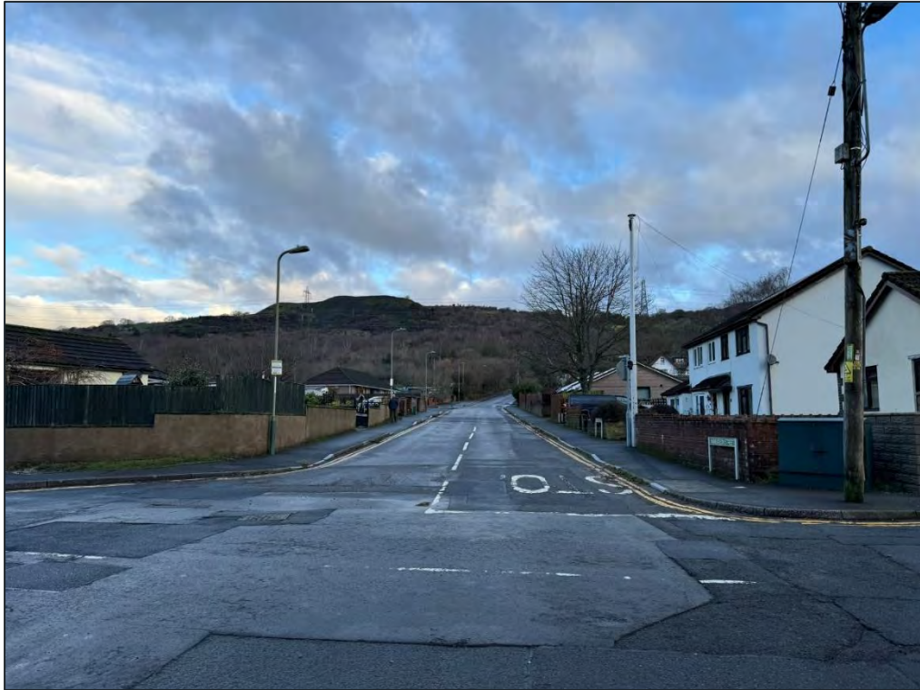
Plate 92. North facing view of Bedwas Tips (HA4) from Thomastown.