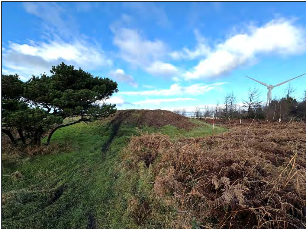
Plate 31. Northwest facing view of Twyn Cae-Hugh Round Barrow (HA6).