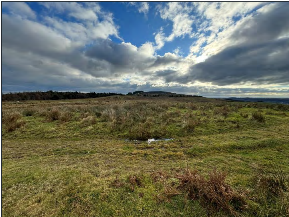
Plate 57. Southeast facing view of Common (HA5).