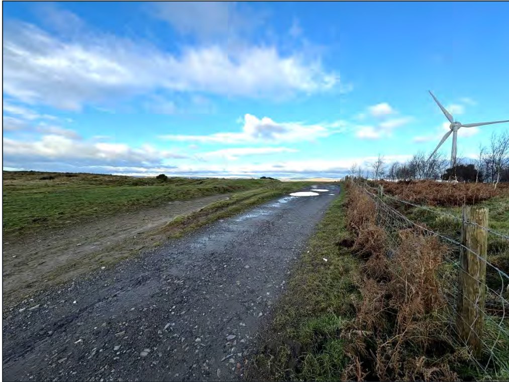
Plate 34. Northwest facing view from Twyn Cae-Hugh Round Barrow (HA6).