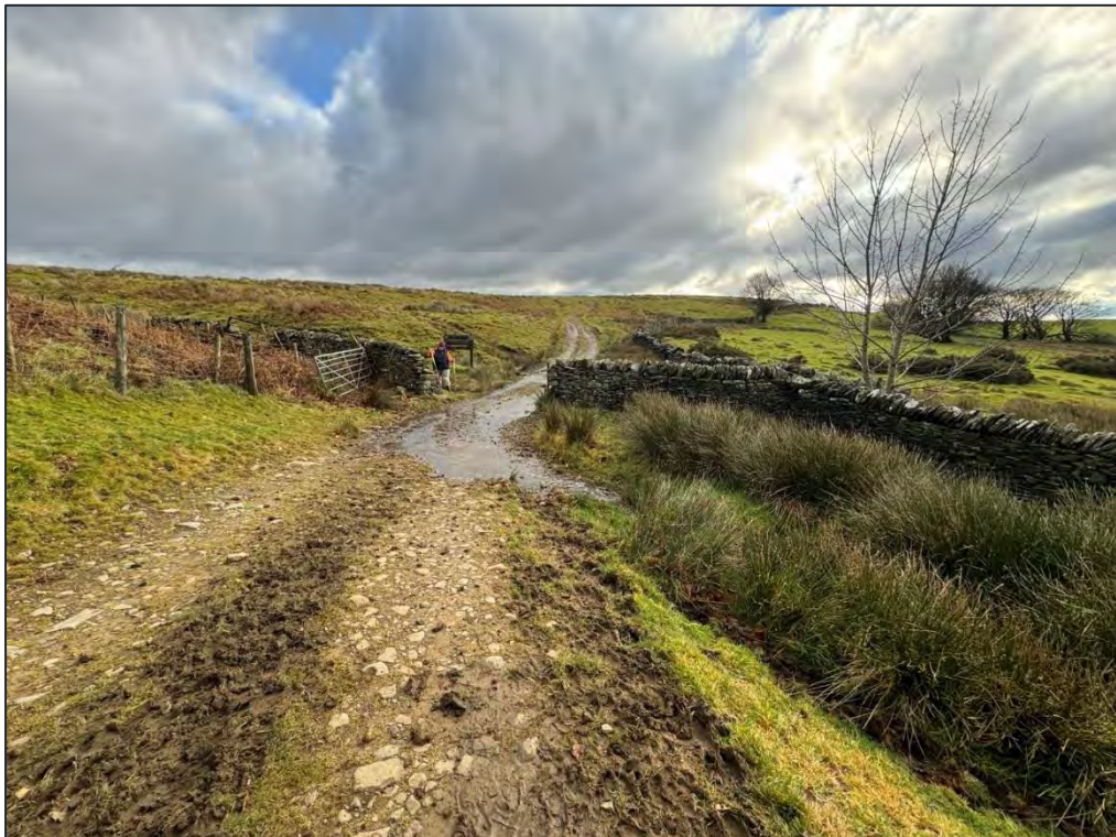
Plate 49. Southeast facing view of northwest corner drystone boundary of Common (HA5)