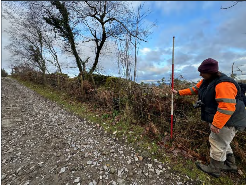
Plate 8. North facing view of southwest boundary of Mynydd y Grug drystone wall field boundary (HA1)