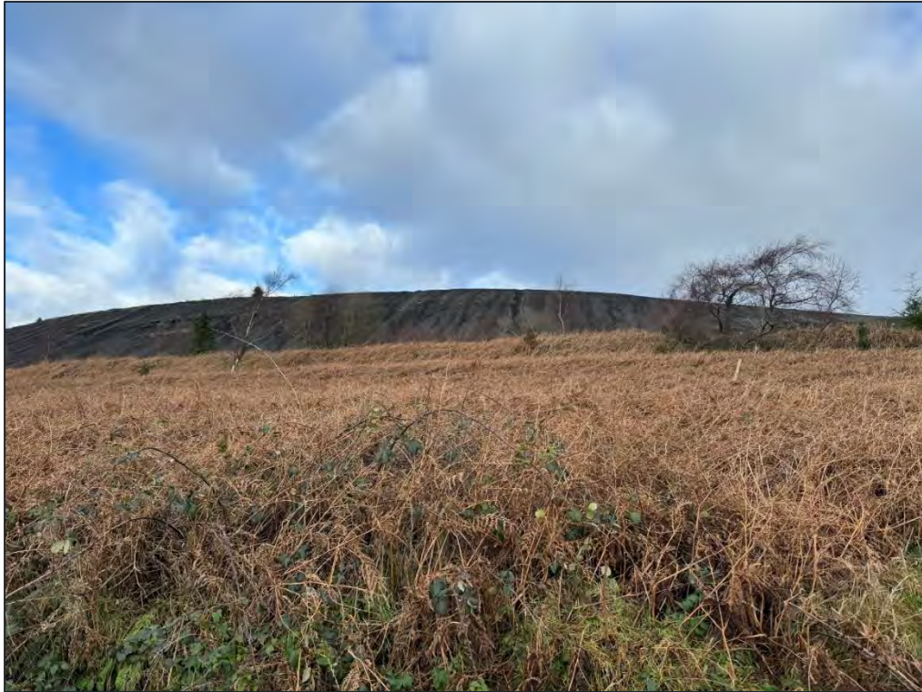
Plate 72. Northeast facing view of Upper Tip (Tip 2).