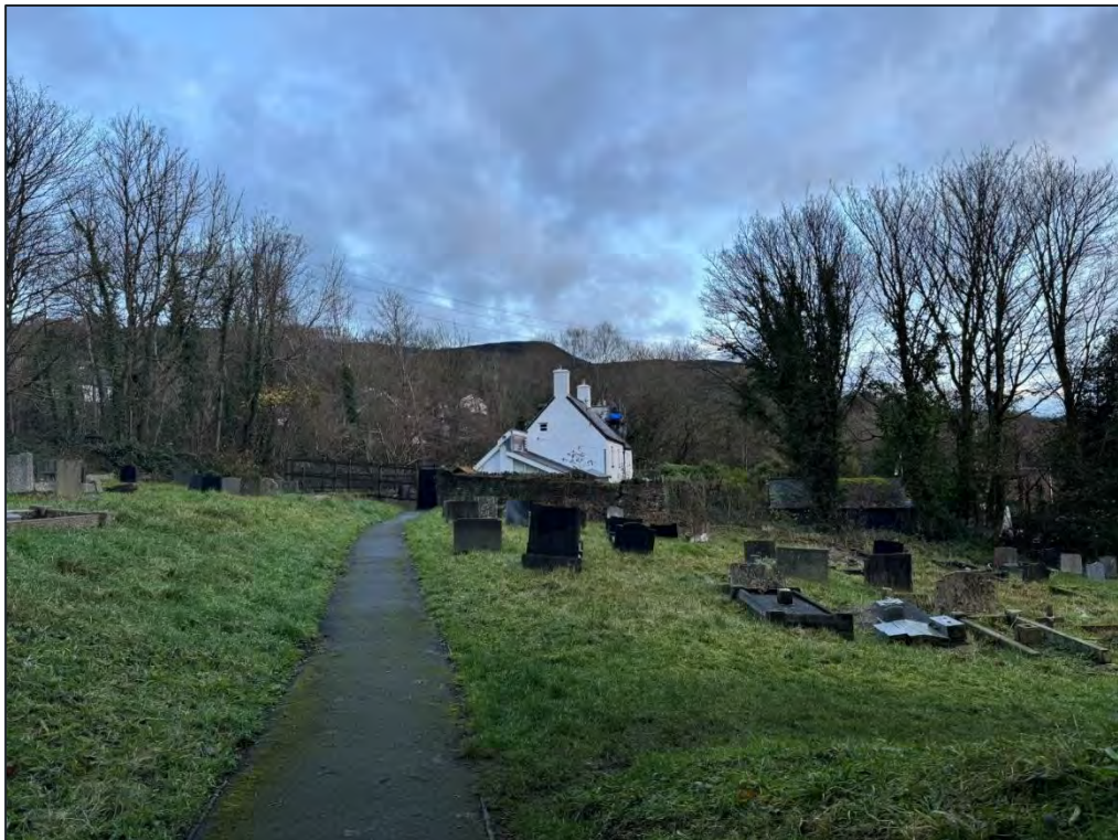
Plate 89. East facing view from St Barrwg's Church (HA35) towards Old Rectory (LB13551) and Bedwas Tips (HA4).