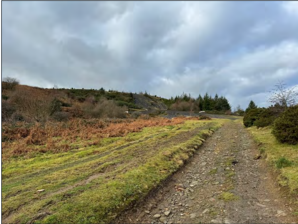
Plate 78. Northwest facing view of Upper Tip (Tip 2) from east.