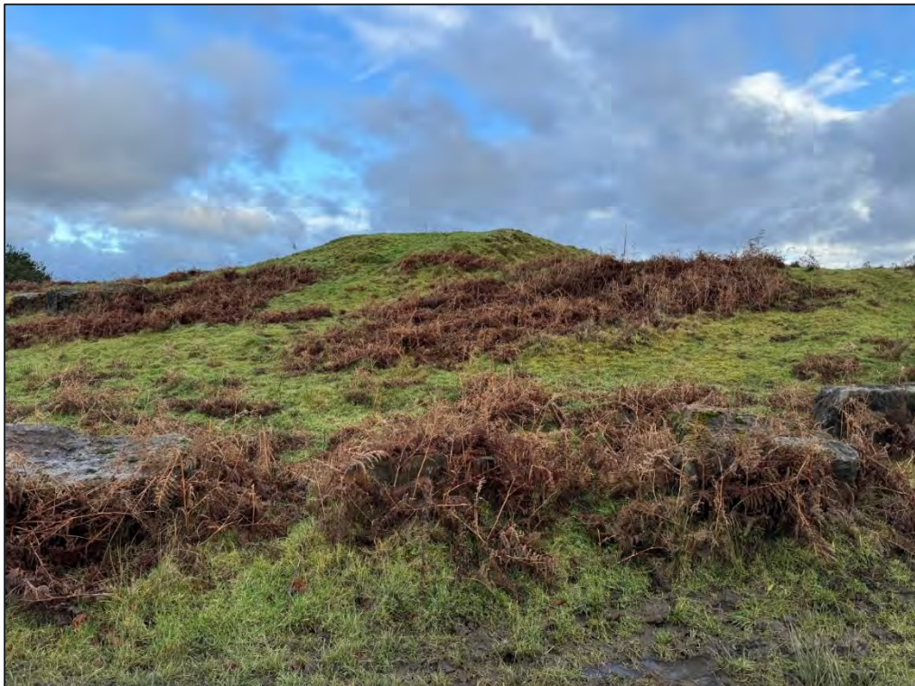
Plate 25. North facing view of Twyn yr Oerfel Western Round Barrow (HA7)