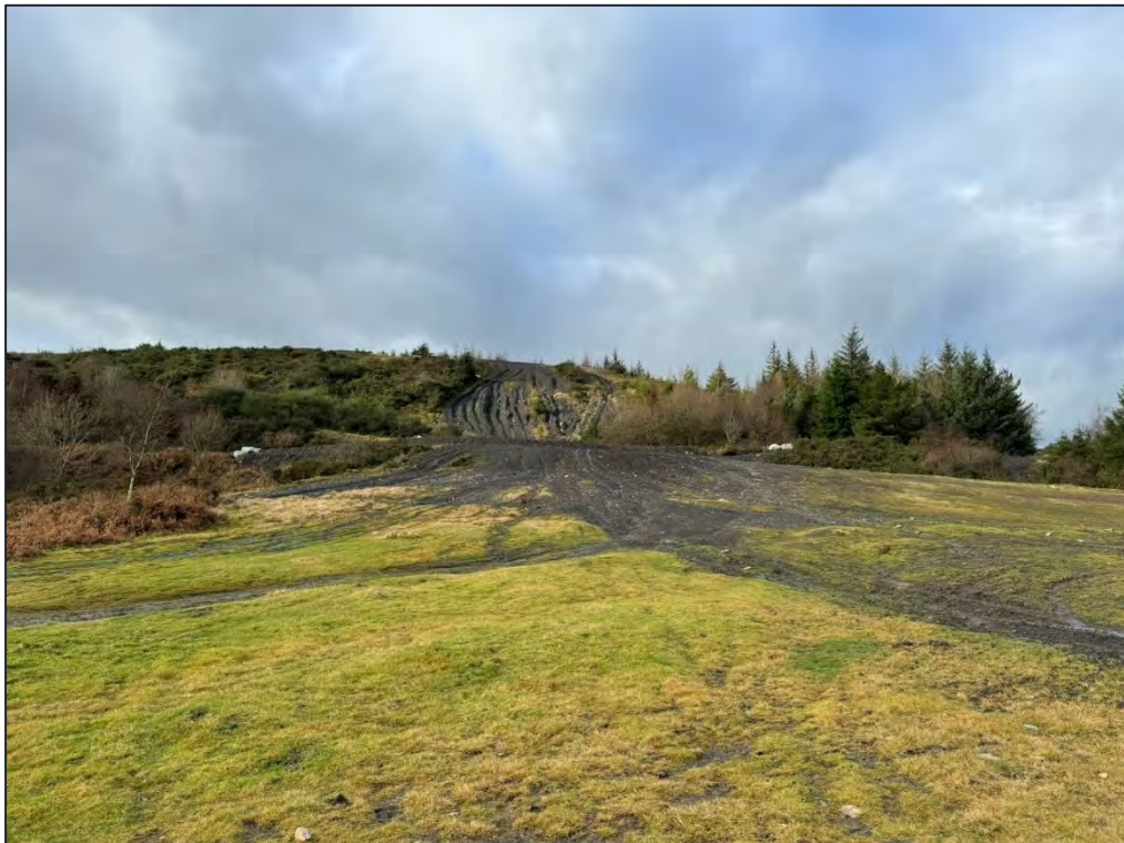
Plate 79. West facing view of Upper Tip (Tip 2) from east.