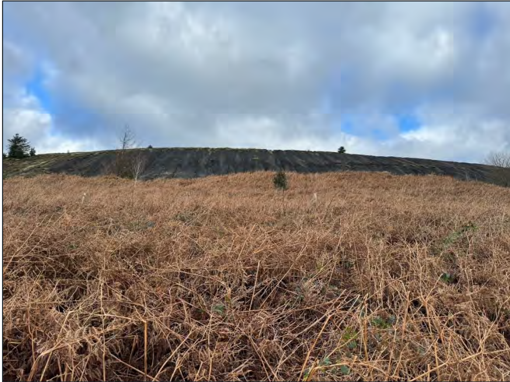
Plate 70. Northeast facing view from Barn (HA19) of Upper Tip (Tip 2).