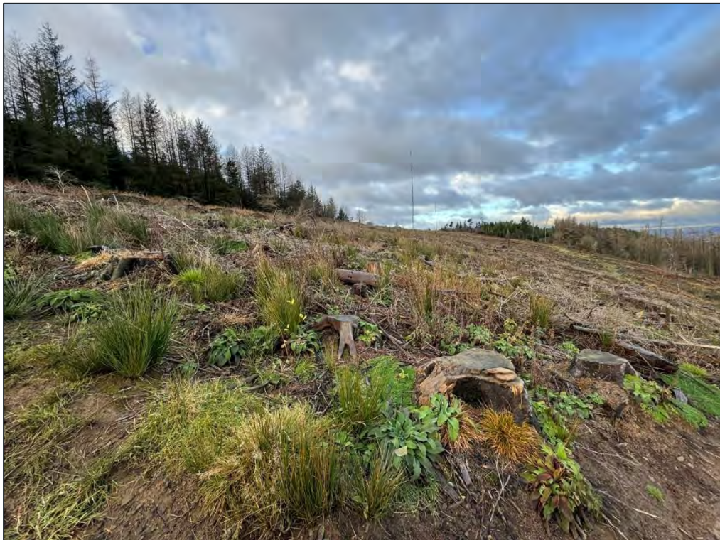
Plate 13. West facing view of Mynydd y Grug field boundary (HA1)