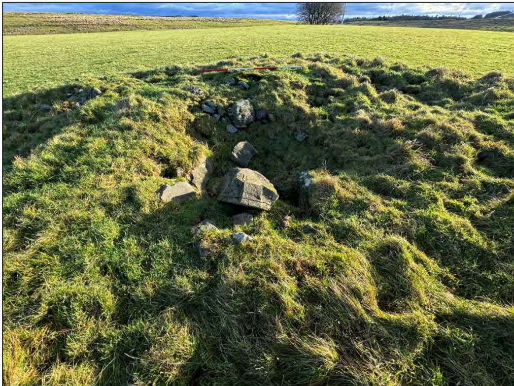
Plate 47. South facing detailed view of Pen-y-rhiw Round Cairn (HA10)