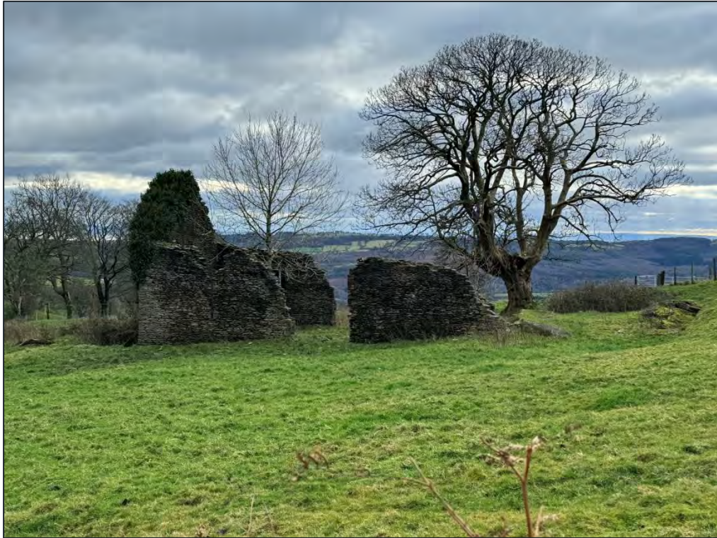
Plate 66. Southwest facing view of Barn (HA19) south of Upper Tip (Tip 2).