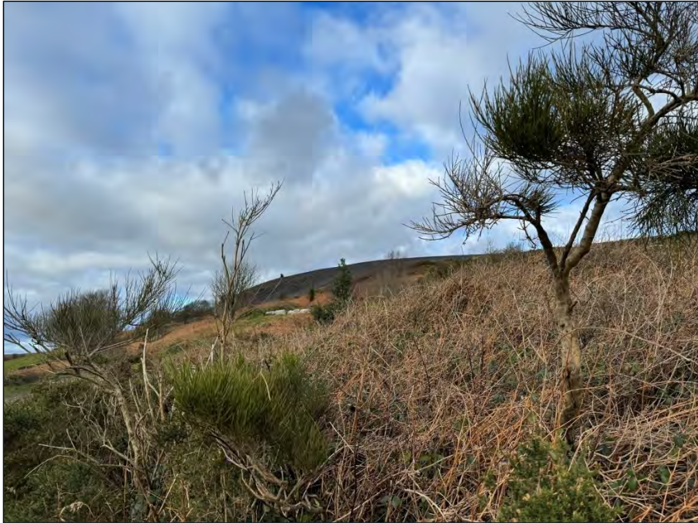
Plate 74. Northwest facing view of Upper Tip (Tip 2) from southeast.