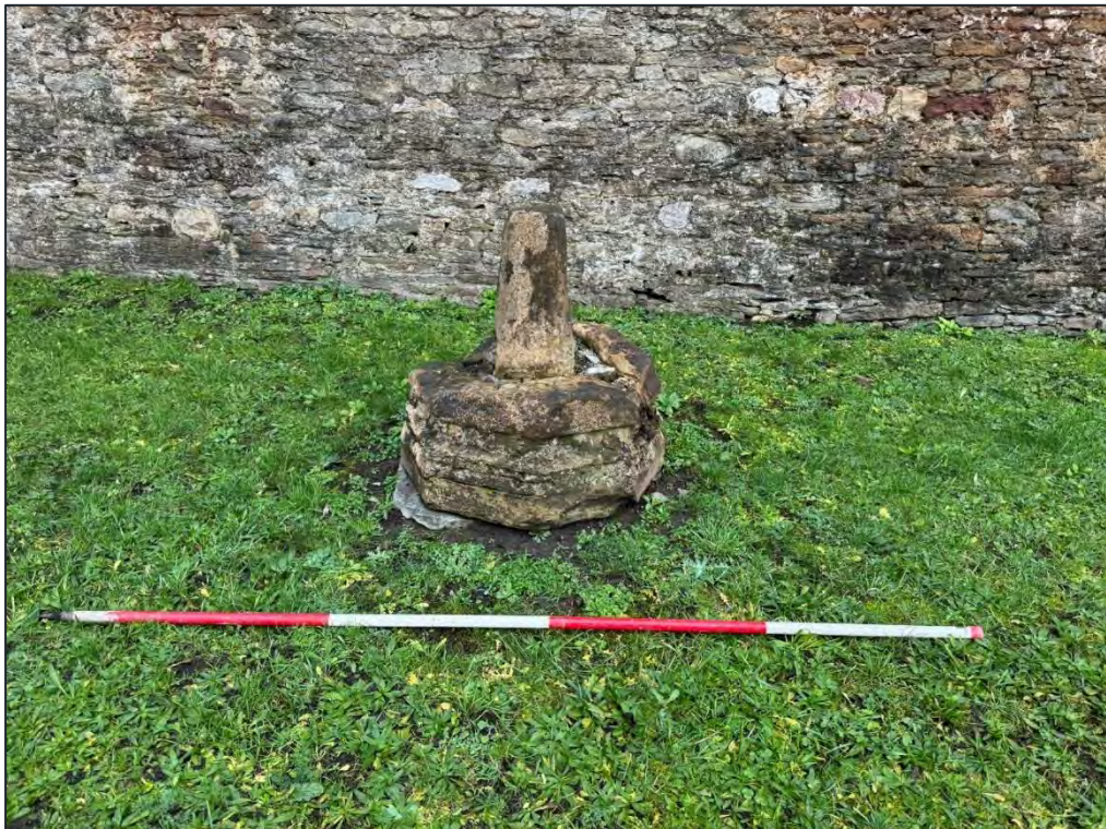
Plate 87. North facing view of St Barrwg's Churchyard Cross (HA34).