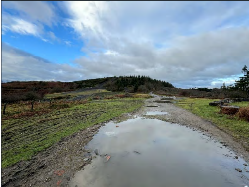
Plate 26. West facing view from Twyn yr Oerfel Western Round Barrow (HA7) Towards Upper Tip (Tip 2).