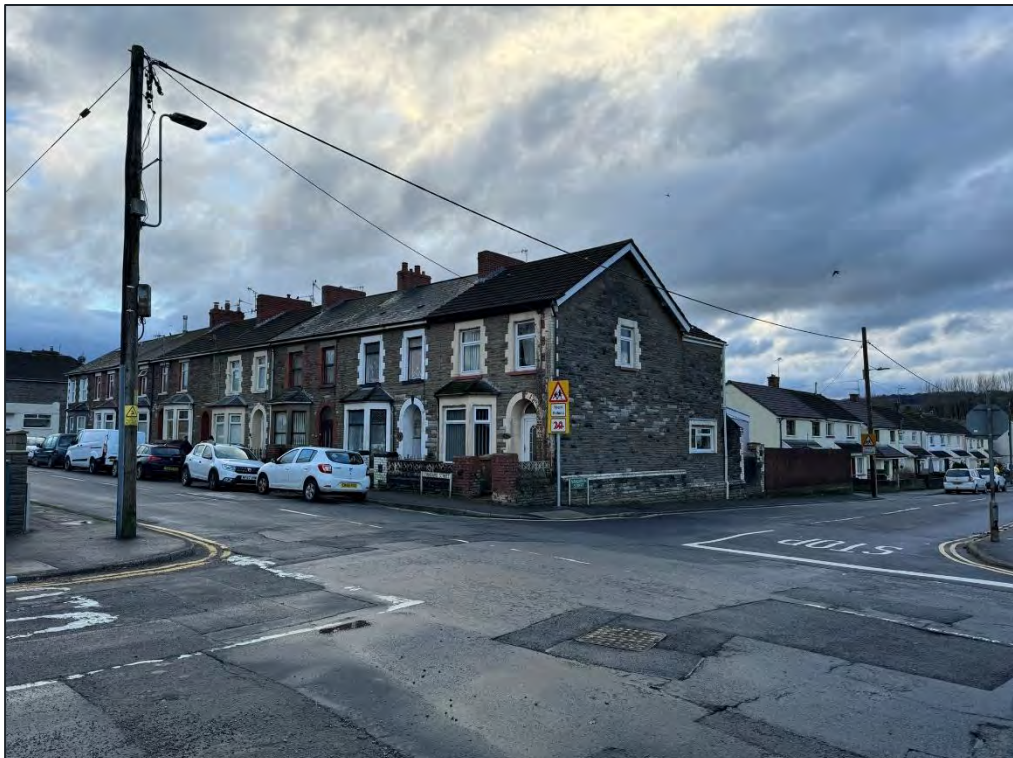
Plate 91. Southeast facing view towards Thomastown.