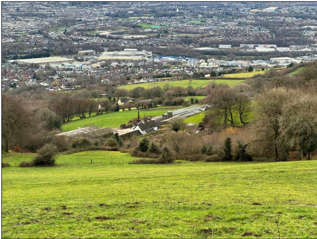
Plate 71. Southwest facing view from Upper Tip (Tip 2) showing Caerphilly Castle (HA40) top centre.