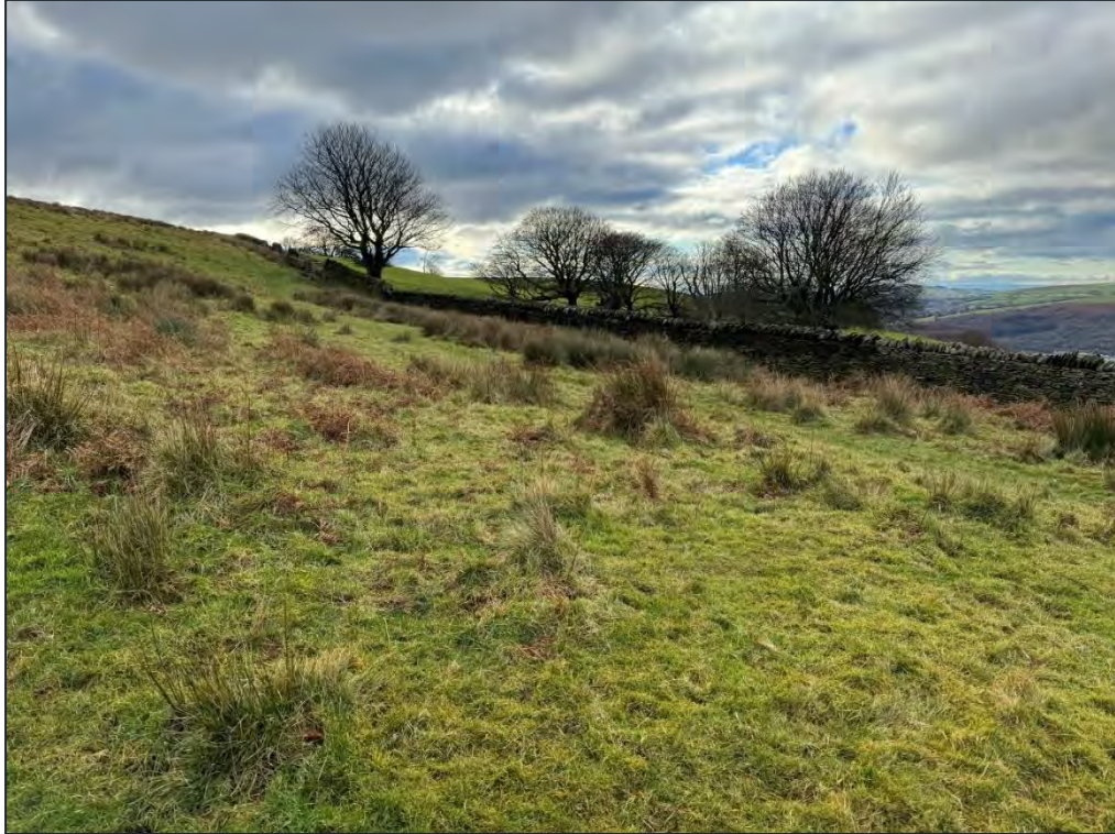
Plate 50. South facing view of western drystone wall boundary of Common (HA5)