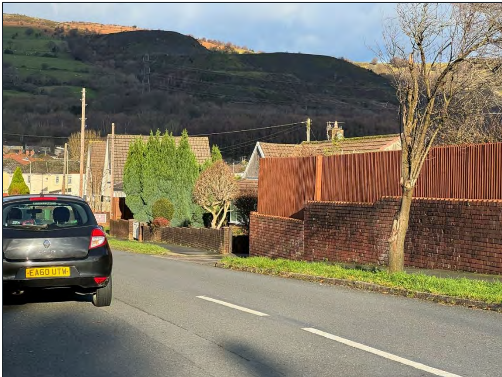
Plate 81. North facing general view of Tips (HA4) from Bedwas Council Offices.