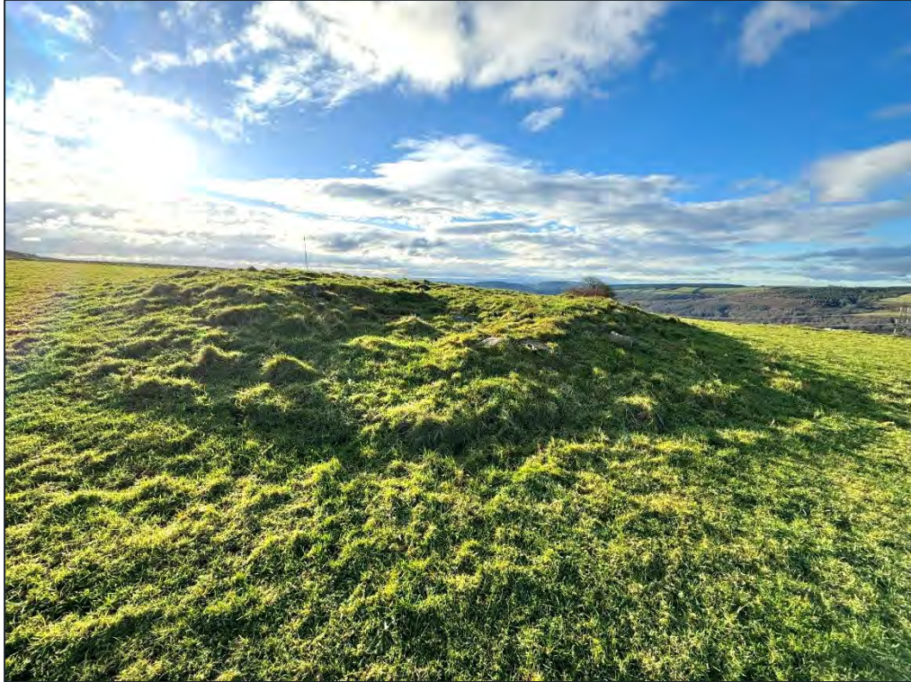
Plate 46. South facing view of Pen-y-rhiw Round Cairn (HA10)