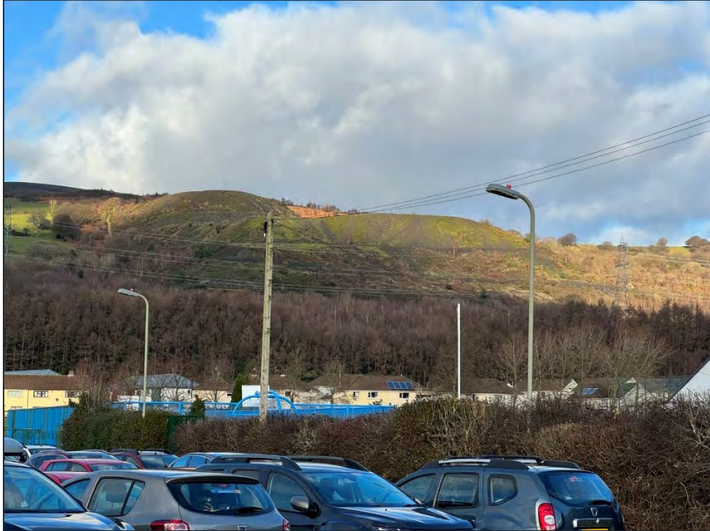
Plate 84. Northeast facing general view of tips (HA4) from Bedwas High School.