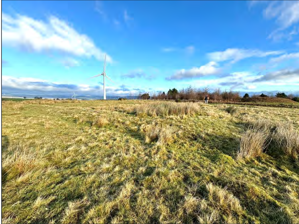
Plate 38. Northeast facing view of ditch and bank enclosure/ pound (HA2)